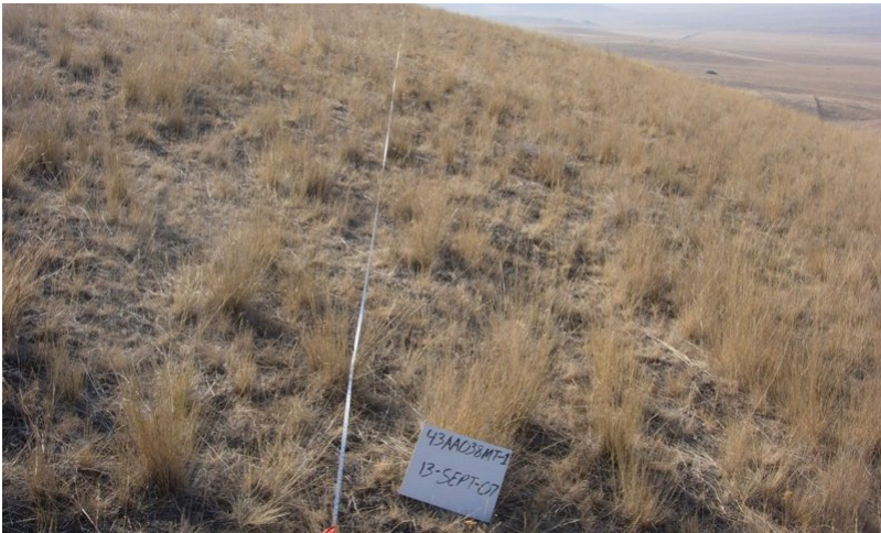
Figure 7. 43AA Droughty Steep 1