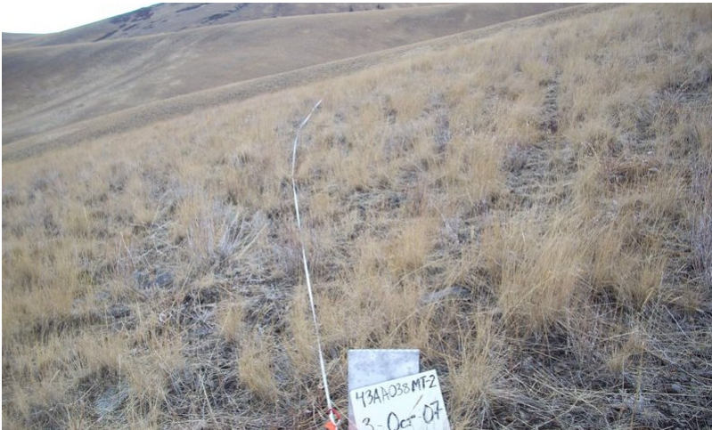
Figure 8. 43AA Droughty Steep 2

The Bluebunch Wheatgrass Community (1.1) is dominated by bluebunch wheatgrass, a taller cool-season bunchgrass with a minor component of forbs and low-growing shrubs. Bluebunch wheatgrass is typically the dominant species in the Bluebunch Wheatgrass Community (1.1). Rough fescue ( Festuca campestris ) occurs in the reference community in the more mesic portion of the LRU, increasing to approximately 20% of species composition by dry weight in the wetter end of the LRU. Needleandthread, Idaho fescue ( Festuca Idahoensis ), Sandberg bluegrass ( Poa secunda ), and prairie junegrass ( Koeleria macrantha ) are subdominant. Many common forb species exist on this site, including arrowleaf balsamroot ( Balsamorhiza sagittata ). Low-growing shrub species, including fringed sagewort ( Artemisia frigida ), are present as a minor part of the community. The Taller Bunchgrass State generally occurs on the Droughty Steep site in areas where proper grazing management practices have been implemented over a long period. The Bluebunch Wheatgrass Community can be maintained through the implementation of properly managed grazing that provides adequate growing-season deferment to allow establishment of taller grass propagules and/or the recovery of vigor of stressed plants. The Bluebunch Wheatgrass