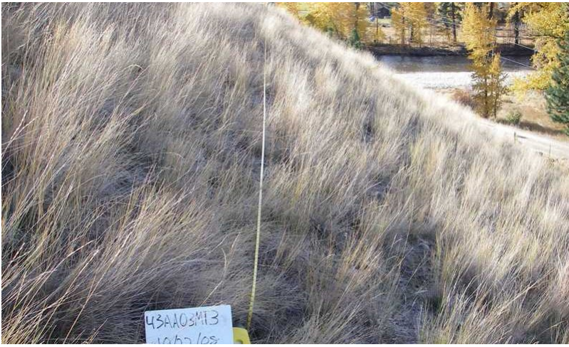
Figure 6. 43AA Droughty Steep 3