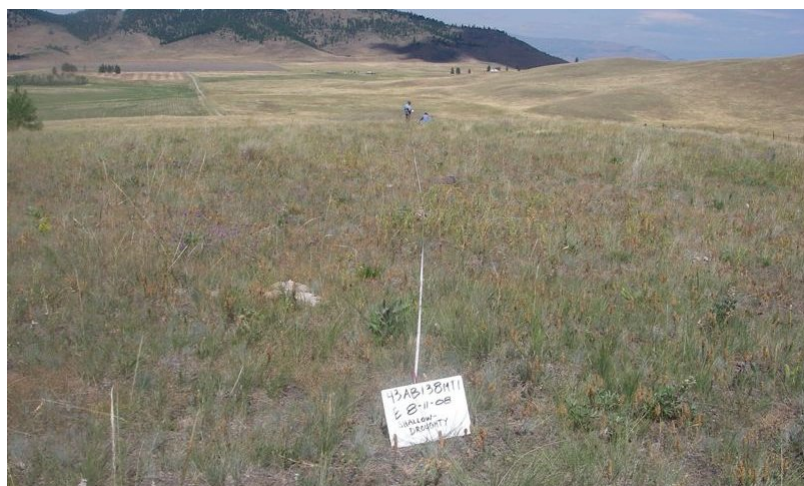
Figure 5. 43AB Shallow Droughty 2