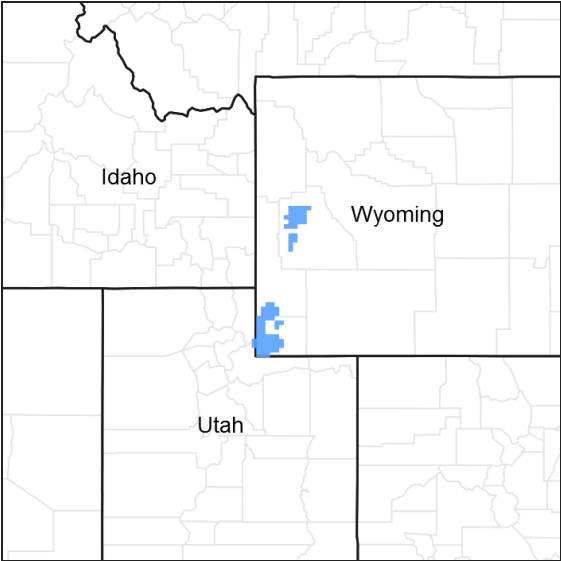
Figure 1. Mapped extent

Provisional. A provisional ecological site description has undergone quality control and quality assurance review. It contains a working state and transition model and enough information to identify the ecological site.