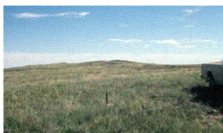
Figure 2. 58AC Claypan 11-14" MAP Plant Community 1

The physical aspect of this site in the Historical Climax (HCPC) is that of a moderately sparse grassland and shrub land that is dominated by cool season grasses with shrubs distributed throughout. Approximately 70–80% of the annual production is from grasses and sedges, 1–5% from forbs, and 2–10% is from shrubs and half-shrubs. The canopy cover of shrubs is 1 to 10%. This is the interpretive plant community and is considered to be the Historic Climax Plant Community (HCPC) for this site. This plant community contains a diversity of tall and medium height, cool season grasses (green needlegrass, western or thickspike wheatgrass, and bluebunch wheatgrass), and short grasses (blue grama, Sandberg bluegrass). There are numerous forbs that occur in smaller percentages. Shrubs and half-shrubs such as Nuttall's saltbush and winterfat are common. Wyoming big sagebrush is also often a common component of this community. This plant community is well adapted to the Northern Great Plains climatic conditions. The diversity in plant species and presence of tall, deep-rooted perennial grasses allows for drought tolerance. Plants on this site have strong, healthy root systems that allow production to increase significantly with favorable moisture conditions. Abundant plant litter is available for soil building and moisture retention. This plant community provides for soil stability and a functioning hydrologic cycle.