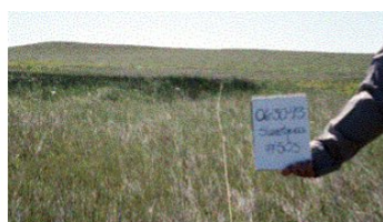
Figure 3. 58AC Saline Subirrigated 11-14" MAP Plant Communit

Slight degradation in the historic climax plant community, including a beginning response to non-prescribed grazing, will tend to change the HCPC/PPC to a community represented by an increase in black greasewood or silver buffaloberry and inland saltgrass, western wheatgrass, Sandberg bluegrass and mat muhly. The medium and tall grasses such as basin wildrye, alkali cordgrass and alkali sacaton will still be present, sometimes in relatively large amounts. The desirable shrubs such as Nuttall's saltbush will be somewhat less prevalent. There may be an increase in some forbs such as poverty sumpweed and seepweed. Grass biomass production and litter become reduced on Community 2 as the taller grasses become less prevalent, increasing evaporation and reducing moisture retention. Additional open space in the community can re