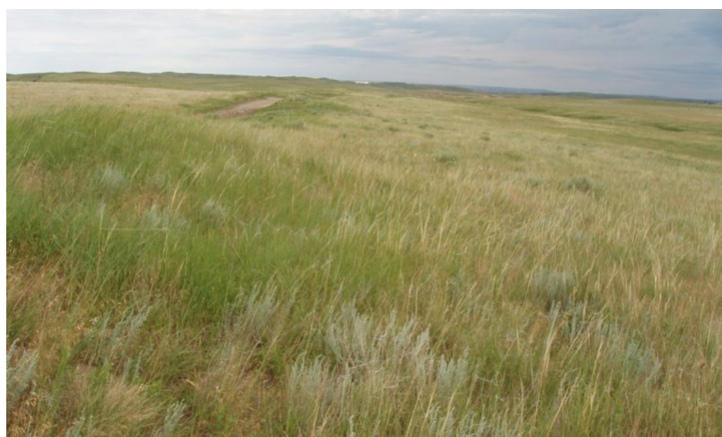
Figure 10. Plant Community Phase 1.1

The plant community upon which interpretations are primarily based is the Bluestem-Prairie Sandreed Plant Community (1.1). This is also considered the Reference Plant Community. This plant community occurs on areas that are properly managed with grazing and/or on areas receiving occasional short periods of non-use. This plant community consists chiefly of tall- and mid- warm-season grasses. Principal dominants are big or sand bluestem, prairie sandreed, little bluestem, and needle and thread. Grasses and grass-likes of secondary importance are sand