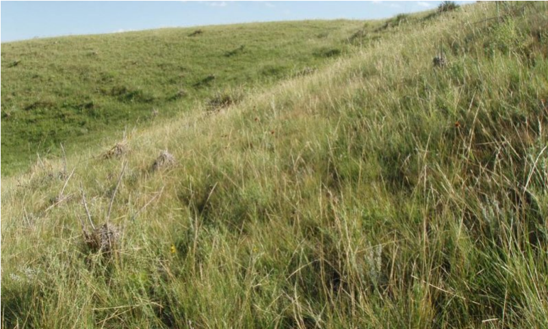
Figure 10. Plant Community Phase 1.1.

This state represents what is believed to represent the natural range of variability that dominated the dynamics in this ecological site prior to European settlement. This site is dominated by cool- and warm-season grasses. In pre-European times the primary disturbances included fire and grazing by large ungulates and small mammals. Favorable growing conditions occurred during the spring and the warm months of June through August. This State can be found on areas having a history of proper grazing management, including adequate recovery periods between grazing events.