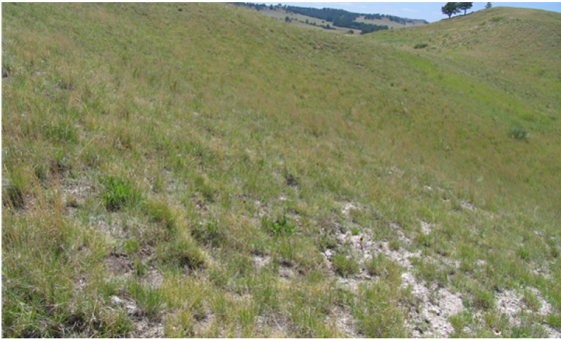
Figure 15. Plant Community Phase 1.3.

This plant community is a result from heavy grazing over many years. Diversity is diminished, as the short grasses become dominant in the plant community. The grazing-tolerant blue grama and sedges replace little bluestem and needlegrasses. Sideoats grama remains in the plant community, but is less productive because of competition and grazing pressure. Due to low palatability, cudweed sagewort, milkvetch, heath aster, and green sagewort become more prevalent in the plant community. Fringed sagewort is the dominant shrub in this plant community. The potential vegetation is about 75 to 85 percent grasses or grass-like plants, 5 to 15 percent forbs, and 5 to 10 percent shrubs. This plant community is resistant to change. The herbaceous species present are less palatable than the dominant species in the Reference Plant Community (1.1).