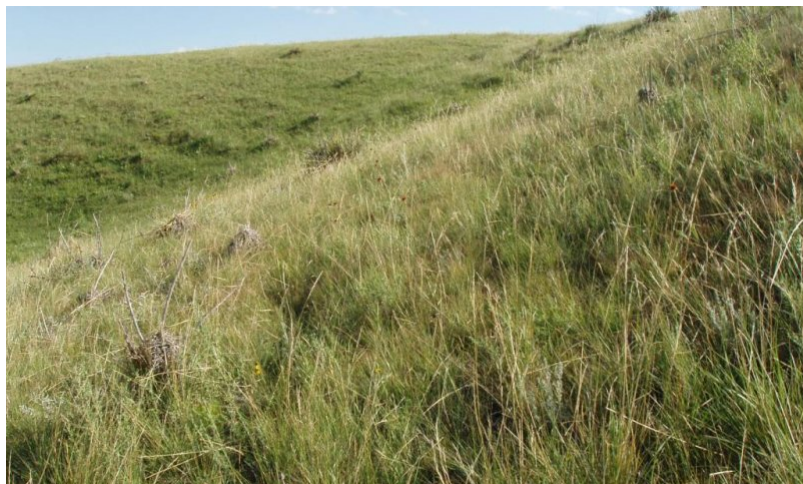
Figure 10. Plant Community Phase 1.1.

The plant community upon which interpretations are primarily based is the Little Bluestem-Needlegrass-Grama Plant Community. This is also considered to be the Reference Plant Community. This plant community can be found on areas that are properly managed with grazing and/or prescribed burning, and on areas receiving occasional short periods of deferment. The potential vegetation is about 75 to 85 percent grasses or grass-like plants, 5 to 15 percent forbs, and 5 to 10 percent shrubs. A mixture of cool- and warm- season grasses dominate the plant community. Major grasses include little bluestem, needle and thread, sideoats grama, and blue grama. Other grasses and grass-likes occurring include sedge, western wheatgrass, green needlegrass, and prairie Junegrass. Significant forbs include purple coneflower, dotted gayfeather, and prairie clover. Significant shrubs found in this plant community include fringed sagewort, rose, and yucca. This plant community is extremely resilient and well adapted to the Northern Great Plains climatic conditions. The diversity in plant species allows for high