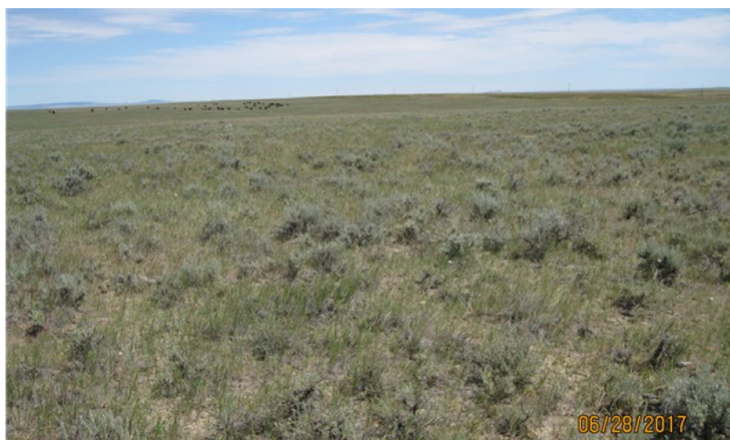
Figure 9. Plant Community Phase 1.1 (13-16" PZ).

The plant community upon which interpretations are primarily based is the Rhizomatous Wheatgrass-Green Needlegrass Plant Community (1.1). This is also considered the Reference Plant Community. This plant community