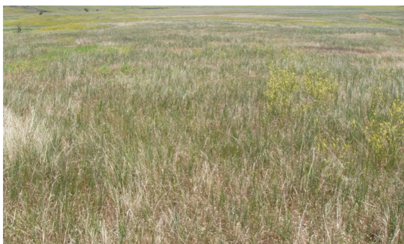
Figure 8. Plant Community Phase 1.1 (16-18" PZ).