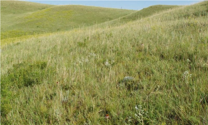
Figure 10. Plant Community Phase 1.1

This state represents what is believed to represent the natural range of variability that dominated the dynamics in this ecological site prior to European settlement. This site is dominated by cool- and warm-season grasses. In pre-European times the primary disturbances included fire and grazing by large ungulates and small mammals. Favorable growing conditions occurred during the spring and the warm months of June through August. This State can be found on areas having a history of proper grazing management, including adequate recovery periods between grazing events.