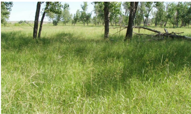
Figure 10. Lowland - PCP 1.1.

The plant community upon which interpretations are primarily based is the Rhizomatous Wheatgrasses-Green Needlegrass/Cottonwood Plant Community. This is also considered the Reference Plant Community. Potential