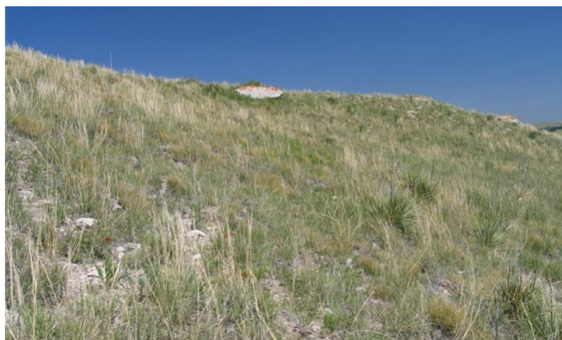
Figure 10. Plant Community Phase 1.1

The plant community upon which interpretations are primarily based is the Needle and Thread-Prairie Sandreed Plant Community (1.1). This is also considered the Reference Plant Community. Potential vegetation is about 65 to 75 percent grasses or grass-like plants, 5 to 15 percent forbs, and 10 to 20 percent woody plants. The plant community is a mix of warm- and cool-season mid-grasses. Major grasses include needle and thread, prairie sandreed, little bluestem, and sideoats grama. Other grasses occurring include bluebunch wheatgrass, Sandberg bluegrass, blue grama, and threadleaf sedge. The plant community is stable and well adapted to the Northern Great Plains climatic conditions. The diversity in plant species allows for high drought resistance. This is a sustainable plant community (site/soil stability, watershed function, and biologic integrity).