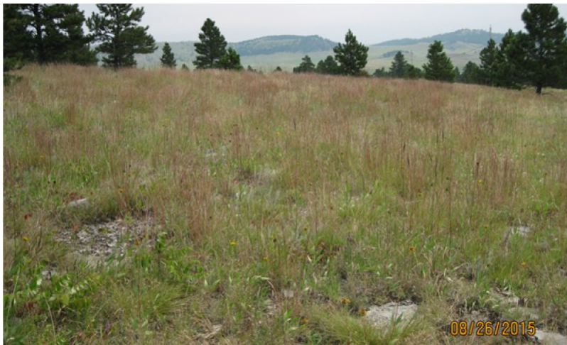
Figure 9. SwLy North - PCP 1.1 (Summer)

Interpretations are based primarily on the Bluestem-Sideoats grama-Rhizomatous wheatgrass plant community phase. This is also considered to be the reference or historic community. The potential vegetation is about 80 percent grass, 10 percent forbs, and 10 percent trees and shrubs. Average annual production for this plant community phase on a median year is 2,200 lbs/Ac. The community is dominated by tall and mid-height warm-season grasses with cool-season grasses being subdominant. The dominant grasses include little bluestem, big bluestem, and sideoats grama. Western wheatgrass and needlegrasses also comprise a significant amount of the plant community. Ponderosa pine can be scattered throughout the site but will not exceed 2 percent canopy cover. Other grasses include prairie dropseed, tall dropseed, blue grama, sedge and slender wheatgrass. This plant community is productive and resilient to disturbances such as drought and fire. This is a sustainable plant community in regards to soil/site stability, watershed function, and biological integrity.