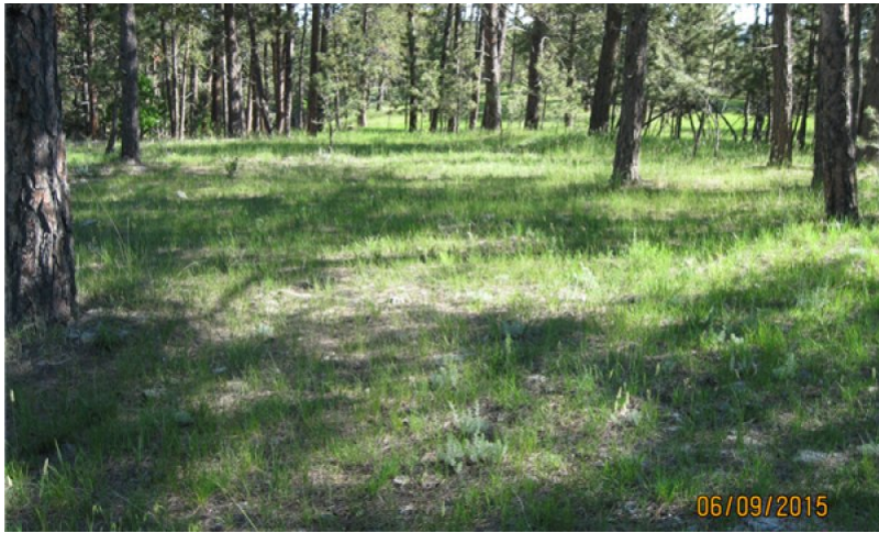
Figure 12. SwLy North - PCP 3.1 Ponderosa Pine

This plant community is characterized by the dominance of conifers as a result of heavy continuous season-long grazing, and no fire, or no use and no fire. Ponderosa pine make up approximately 30 percent of the plant community, and shrubs approximately 15 percent. Grasses and forbs make up approximately 55 percent of the plant community. Dominant grass and grass-like plants include Kentucky bluegrass, slender wheatgrass, needleandthread, rough-leaved rice grass, and upland sedge. Dominant forbs include cudweed sagewort, coneflower, and dotted gayfeather. Prevalent shrubs include fringed sagewort, wild rose, poison ivy, and skunkbush sumac. Most of these shrubs rarely exceed one foot in height. Ponderosa pine is the dominant tree species; and Rocky Mountain juniper is sometimes present as a subordinate tree, but does not dominate.