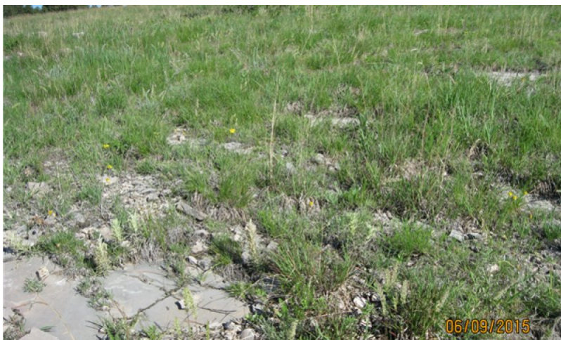
Figure 8. SwLy North - PCP 1.1 (Spring)