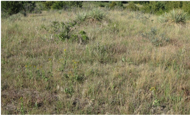
Figure 8. Very Shallow - R063BY016SD - PCP 1.1.