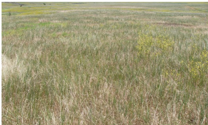
Figure 8. Dense Clay - R063BY018SD - PCP 1.1.