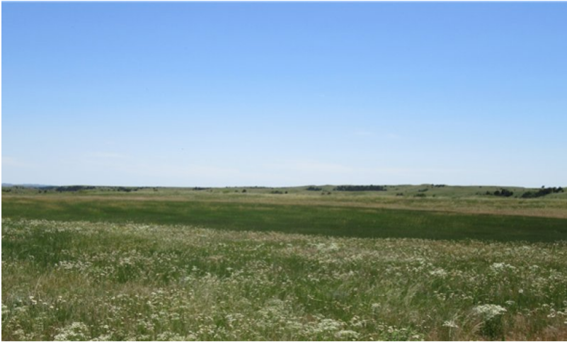
Figure 8. Closed Depression - PCP 1.1 Wet Phase.