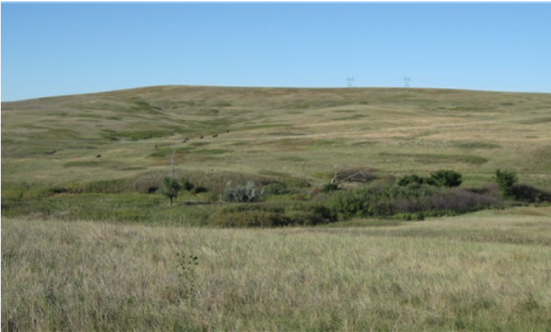
Figure 11. Loamy Overflow - PCP 2.1.

burning, and sometimes on areas receiving occasional short periods of rest. Warm-season species can decline and a corresponding increase in cool-season grasses will occur.