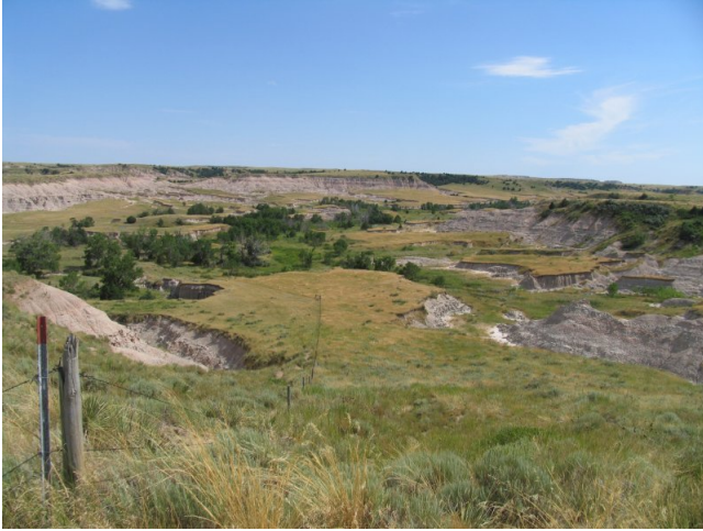
Figure 2. Badlands Overflow and Badlands Terrace complex in Pennington County, South Dakota.