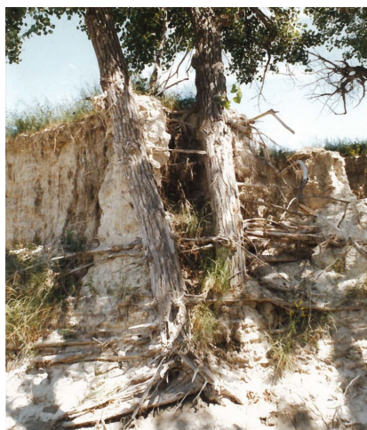
Figure 9. The Interior soil in Sioux County, Nebraska. This soil profile illustrates the dynamics of deposition and downcutting on this ecological site.

More information regarding the soil is available in soil survey reports. Contact the local USDA Service Center for details specific to your area of interest, or go online to access USDA's Web Soil Survey.