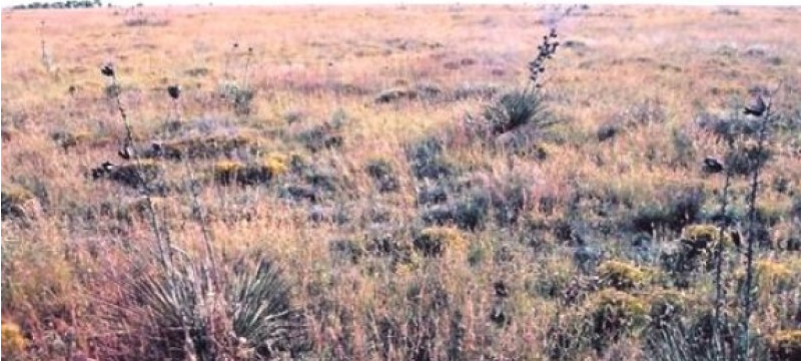
Figure 11. 2. Midgrass / Shortgrass/ Shrub Community

This plant community still falls within the boundaries considered to be reference state, although there is some woody shrub encroachment. Occasional periodic fires would probably limit the population of woody plants. The main grasses are still blue grama and sideoats grama. Broom snakeweed and yucca are beginning to increase. Some control of woody plants may become necessary in the future if the objective is to maintain the reference state. Since the threshold has not been crossed at this stage, this community would be considered to be within normal fluxes of the reference state although it is obvious that shrubs are increasing.