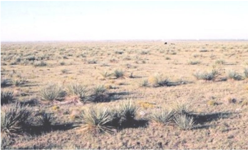
Figure 14. 3. Yucca/Shortgrass Community

This plant community has crossed a threshold since the site does not resemble the reference state. It is obvious that outside energy will have to be introduced to effect a change in vegetation. This Limy Upland site is now dominated by yucca, but still has shortgrasses and very few midgrasses present. There is serious perennial three-awn encroachment. The site is moving towards a yucca/shortgrass community. Plant vigor is low, production is low, and the community is not functioning well hydrologically. Runoff has increased; infiltration has declined. Plant residues are insufficient to protect the soil surface. Careful management can restore this community to a more productive state. Some midgrasses such as sideoats grama do remain, but they are in dire need of help and should be allowed to produce seed for several seasons. Prescribed grazing, brush management, prescribed burning after fuel buildup and time are all necessary to initiate the restoration process on this site.