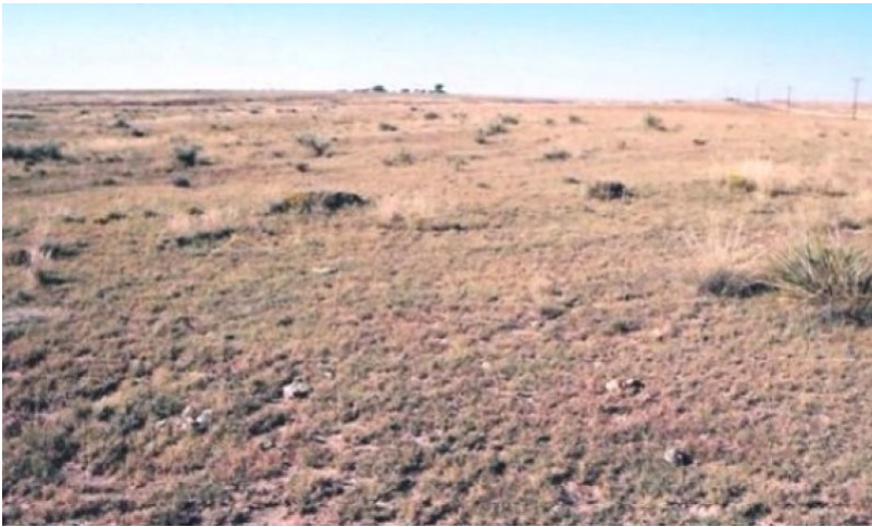
Figure 17. 1. Shortgrass/ Midgrass Community - Low Vigor

This plant community has been subjected to abusive grazing for many years. There are a few midgrasses remaining in the plant community. The dominant grass is blue grama, but it is in a state of low vigor and has a sod bound appearance. Yucca has increased to the point of becoming very noticeable. It would be difficult to restore this site to a midgrass/shortgrass community due to a limited seed source of sideoats grama and other productive perennial grasses. Brush management of yucca will be necessary to restore balance to the community. The likely result of brush management and prescribed grazing will be a return to a midgrass/shortgrass community with improved vigor.