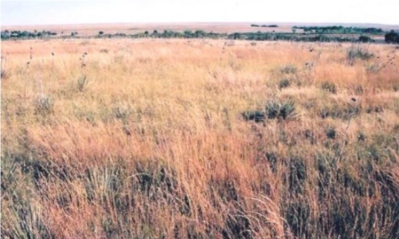
Figure 8. 1. Midgrass / Shortgrass Community

This plant community will be used as the representative plant community. The major grass species are sideoats grama and blue grama with some little bluestem. Lesser amounts of other shortgrasses and midgrasses occur. There are also a few perennial forbs present. The common woody plants observed are plains yucca and broom snakeweed. Production is very good in a Limy Upland site. The plant community is healthy and vigorous.