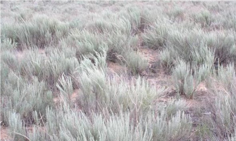
Figure 14. 3.1Shrub Dominant Community

The Shrub Dominant Community (3.1) is a shrub community with sand sagebrush, yucca and possibly skunkbush being the primary woody plants. The understory consists of annual grasses and forbs with very few perennial grasses remaining. Few if any reference community grasses and forbs are present. There will be a high percentage of bare ground scattered throughout the site. Herbaceous forage production is less than half of the reference community. The moisture regime is less than normal because of evapo-transpiration losses and bare ground has increased. Nutrient cycling, the water cycle, watershed protection and biological functions have decreased substantially. Major energy and economic inputs are required to change the Shrub Dominant Community (3.1) back to near reference conditions. Brush and pest management, prescribed grazing, and perhaps range seeding will be necessary at a major expense. This site is not particularly resistant to heavy grazing but exhibits amazing resilience. If even a small seed source of the tallgrasses remains and some old root crowns are still viable, then recovery is possible with minimal re-seeding. Recovery can occur fairly rapid if the competitive plants are controlled and proper grazing management is applied. Full recovery and maintenance of the reference community requires continued proper grazing management as well as occasional brush and pest management.