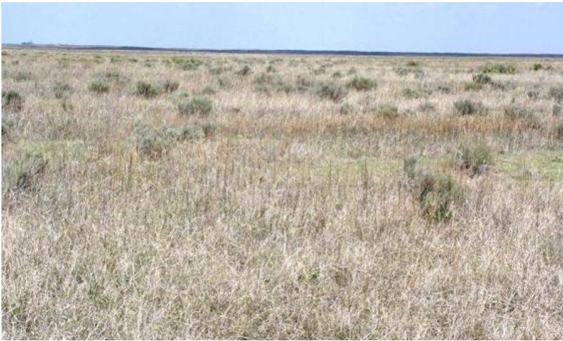
Figure 11. 2.1 Midgrass/Shrubs/Annual Forbs Community

This plant community represents the first phase in the transition of the Midgrass/Shrub Community (2.1) toward the Shrub Dominant Community (3.1). As retrogression proceeds, the tallgrasses give way to an increase in midgrasses such as sideoats grama, dropseed species and perennial three-awn. The better quality forbs are replaced with less palatable species such as gaura, western ragweed, annual wild buckwheat and camphorweed and there will be an increase in annual forbs. Sand sagebrush, yucca and skunkbush can increase to >20% of the total plant community. The production of vegetation has shifted from mostly herbaceous vegetation to more woody, although the herbaceous vegetation biomass is still the largest amount. Nutrient cycling, the water cycle, watershed protection and biological functions have changed little. Proper grazing and brush management can easily maintain this phase and prevent the transition toward the Shrub Dominant Community phase (3.1).