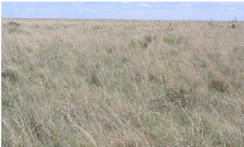
Figure 8. 1.1 Tall/Midgrass Dominant Community