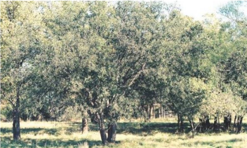
Figure 11. Woodland/Cool-Season Grass Community

The Woodland/Cool-season Grass State is composed of cool-season grasses such as Texas wintergrass and western wheatgrass and has largely replaced the warm-season midgrasses and tallgrasses, which previously dominated the reference plant community. Some of the grasses remaining may include tobosa and alkali sacaton due to their lower palatability and competitive nature, buffalograss, which will tolerate some intermittent shade, silver bluestem, meadow dropseed, and white tridens. The more palatable forbs, such as Maximilian sunflower, Englemann’s daisy, and bushsunflower will be replaced by less preferred forb species, such as western ragweed, silverleaf nightshade, heath aster, and curlycup gumweed. Woody plants will increase strongly to dominate the overstory with total canopy cover approaching 15-20%. Low shrubs will be the first woody plants to increase and invade the community.