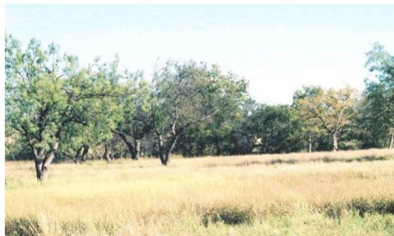
Figure 17. Native Seeded Range Plant Community

The Native Seeded Range Plant Community represents a management-induced vegetative state. This community is the result of artificial revegetation of a degraded natural plant community in an effort to speed vegetative transformation to a native Open Grassland State. The community is produced through the application of mechanical brush management (BM), range planting (RP), and prescribed grazing (PG). Mechanical brush management is used to obtain more effective control of a broader spectrum of brush species and to facilitate seedbed preparation. In areas with significant amounts of pricklypear, mechanical treatments may be integrated with chemical treatment and/or post-seeding prescribed burning (PB) to reduce density of pricklypear. Any plant community can be converted to the Native Seeded Range Plant Community (3). However, it would not be logical to use this option for