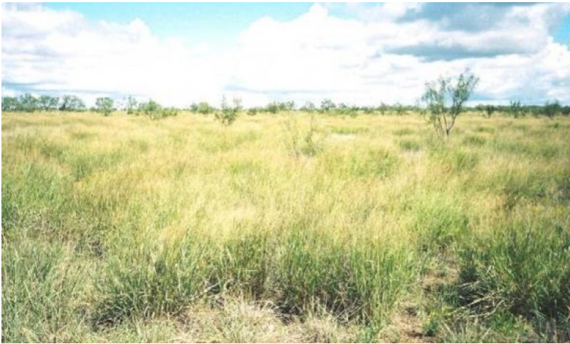
Figure 20. Introduced Seeding Community