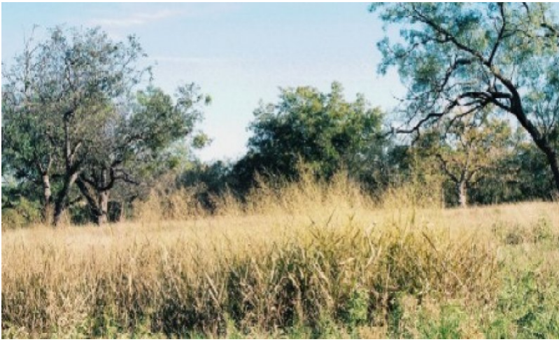
Figure 8. 1.1 Midgrass/Tallgrass Savannah Community