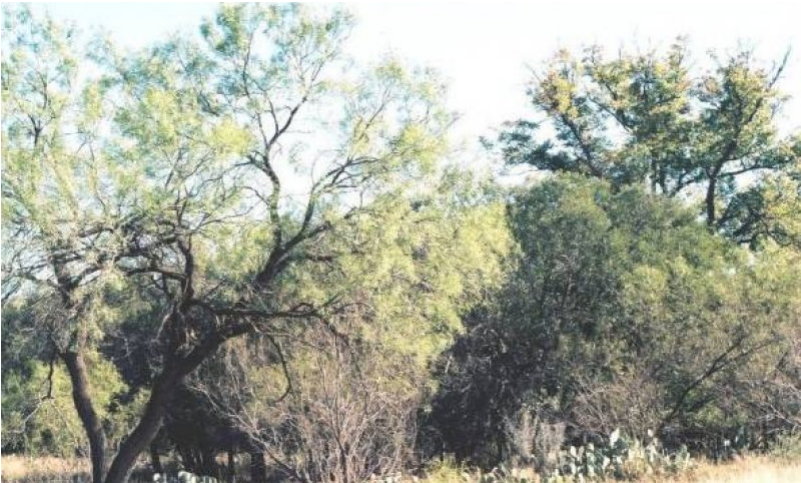
Figure 14. Mesquite/Juniper Woodland Community

selloa, and broom snakeweed ( Gutierrezia sarothrae ). A few shade-tolerant forbs also occur in the understory. Cool-season annual forbs such as filaree, plantain, tansymustard, pepperweed and bladderpod are prevalent following fall and occasional winter precipitation.