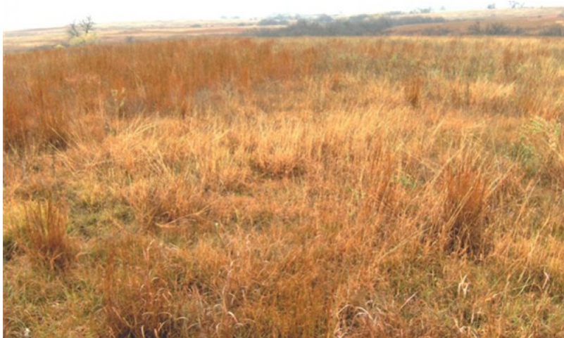
Figure 8. Cordell soils Washita County OK

This is the interpretative plant community description for this site. It is a mixed-grass prairie, dominated by a mixture of little bluestem, sideoats grama, blue grama, hairy grama, dropseed, buffalograss. Palatable perennial forbs are well represented over the site. These forbs include western ragweed, halfshrub sundrop, daisy fleabane, dotted gayfeather, Nutall’s sensitive-brier, Illinois bundleflower, compassplant, prairie coneflower, leadplant, and others. Shrub species including skunkbush sumac, fragrant mimosa, and prickly pear are usually present in small amounts. The amount of woody species on site can be minimized by occasional fire (prescribed burning). This plant community is very durable. With proper grazing management and prescribed burning, the proportions of major grasses and forbs in this community can be maintained indefinitely. Although this site is usually described as a “Mixed Grass Prairie”, it is very obvious that tallgrasses can dominate some inclusional areas of deeper soils. There are also areas that are almost barren.