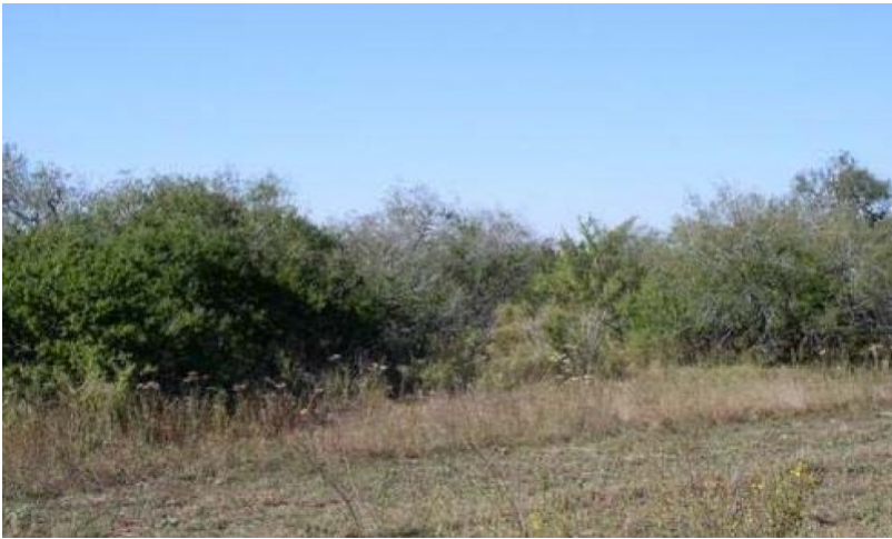
Figure 15. 2.2 Woodland Community

Grazing management has little influence on the woody plants once the threshold is crossed into the Woodland Community (2.2). Live oak with high stem densities composes a significant portion of the woody cover. Mesquite density increases and mottes with an understory of subordinate shrubs, such as granjeno, brasil, and lime prickly-ash have developed. Brush management is necessary to shift the oak or mesquite woodland back to a grassland or parkland. Herbaceous vegetation is scant, and is composed of short grasses and early successional forbs. Prescribed grazing with continued selective brush management and fire will be needed to maintain the parkland.