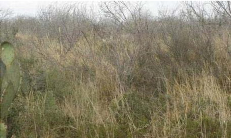
Figure 11. 1.2 Short/Midgrass Dominant Community

This community is resilient, still under the influence of periodic fires, and can easily be transitioned back to community 1.1. This community is stable and maintainable. Continued heavy grazing, coupled with drought cycles, causes the dominant midgrasses to decrease in composition. The opening of the midgrass canopy has caused shortgrasses to increase, forbs to become more abundant, and woody seedlings are able to increase slightly. At this point in time, with reduction in stocking rates, periodic rest, and increased fire frequency, this community can be maintained or shifted back to the previous community. If overgrazing continues, midgrasses will continue to decline, fire frequency and intensity will decrease, and the community will continue to decline toward a totally altered state. Such species as multi-flowered false Rhodesgrass, Arizona cottontop and alkali sacaton are replaced by pink pappusgrass, hooded windmillgrass, plains lovegrass, and perennial three-awn. Shortgrasses like curly mesquite, Hall’s panicum, and sand dropseed also increase.