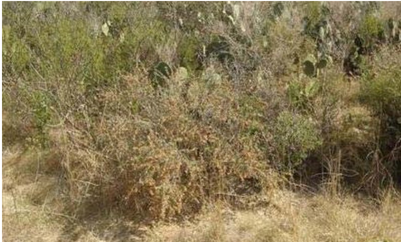
Figure 16. 2.2 Wooded Grassland Community

The Wooded Grassland Community has woody canopies exceeding 40 percent. Midgrasses are found only within thorny shrubs and interspaces. Curly mesquite, Hall's panicum, whorled dropseed may be the only species present. Fire on the site in this state is almost non-existent. This site can be brought back to state 2.1 but not without extensive input of energy and outlays of capital. Because of the diverse woody community, this site in this state is most often manipulated by roller-chopping to enhance it for white-tailed deer, northern bobwhite, or scaled quail. To further enhance it for wildlife, the woody plant community can be manipulated and grazed to maximize use for target species. Many landowners find managing towards this community for wildlife the most suitable option.