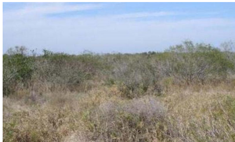
Figure 17. 2.2 Woodland Community

In the absence of fire and brush management, a highly stable woodland develops as shrubs and trees increase in abundance and coalesce. This phase of the Shrubland Complex (2) features a woody shrub canopy greater than 50 percent. Blackbrush, leatherstem, condalia species, mesquite, and the other acacia species may begin to die due to natural causes, leaving a diverse mixed-shrub community. Ground cover and herbaceous production beneath shrub canopies is minimal, but soil organic carbon and nitrogen levels are enhanced. Due to the increase in shrub cover, more nutrients are used by the shrub cover than the herbaceous plants. Forbs and legumes tend to persist on the site, but in this deteriorated condition palatable perennials are replaced by a wide variety of annual forbs. Shortgrasses such as red grama, hairy tridens, gummy lovegrass, and red lovegrass may be the only species present.