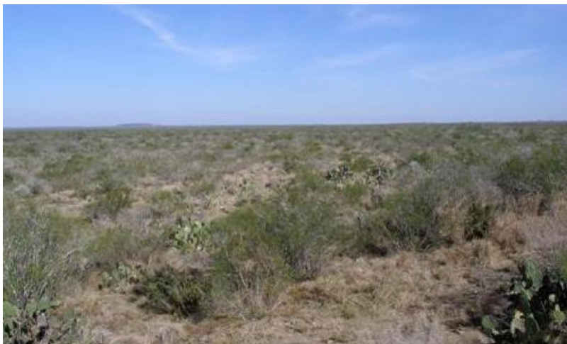
Figure 14. 2.1 Shrubland Complex