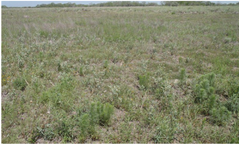
Figure 10. 1.2 Dry Soil Plant Community

In this phase of the Grassland State (1) species from the surrounding landscape begin to increase in abundance because the shallow depression has dried out and seeds that were carried onto the site by overland water flow and animals will germinate. Perennial forbs that are common on the Sandy and Loamy Sand ecological sites will become a larger part of the plant composition but will be highly variable from location to location. Over time the tall/midgrasses will lose dominance as the ecological site becomes extremely dry and plants like buffalograss ( Bouteloua dactyloides ) and creeping lovegrass ( Neeagrostis reptans ) will increase and can become the most abundant species. In modern times, this phase of the plant community has become susceptible to the invasion of bermudagrass ( Cynodon dactylon ) and Kleberg bluestem ( Dichanthium annulatum ), which are aggressive grass species that can be introduced into the plant composition and will quickly dominate the plant community.