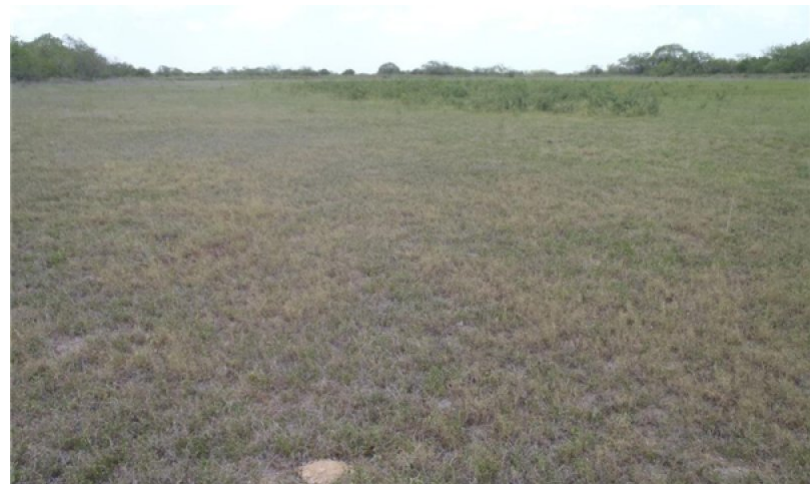
Figure 13. 2.1 Woody Encroachment Community

This plant community is typified by the encroachment of woody species on the ecological site. Seed can be introduced by large rainfall events and/or by grazing animals. Mesquite ( Prosopis glandulosa ), huisache ( Acacia farnesiana ), and retama ( Parkinsonia aculeate ) are the most common species found on this ecological site because of their ability to survive in moist soils. These plants will establish where seed was deposited and continue to expand in numbers as long as growing conditions are conducive. An understory of shrubs does not form under the tree canopy on this ecological site. Grass species and composition will mimic the Grassland State (1). Bermudagrass and Kleberg bluestem are common invasive grasses in this phase and in some cases, may be the most abundant grasses in the plant community.