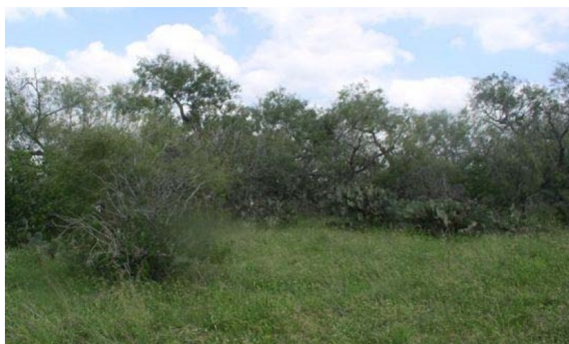
Figure 17. 2.2 Woodland Community

The Woodland community develops from the Shrubland Community when there is no brush management as the woody plants age. Woody canopy is greater than 30 percent. Running or “thicketized” live oak with high stem densities composes a significant portion of the woody cover. Mesquite density increases and mottes with an understory of subordinate shrubs such as granjeno, brasil, and lime prickly ash develop. Brush management is necessary to shift the oak or mesquite woodland back to a previously described plant community. Herbaceous vegetation is scant, and is composed of shortgrasses and early successional forbs. Any brush management activities should be done with prescribed grazing.