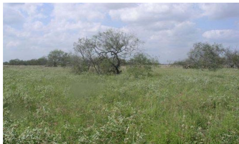
Figure 11. 1.2 Mid/Shortgrass Parkland Community

The Mid/Shortgrass Parkland community results from expansion of oak mottes or increased density of mesquite. Heavy grazing removes the grass fuel that could have sustained the use of fire. The dominant grass species include midgrasses, particularly seacoast bluestem, gulfdune paspalum, Pan American balsamscale, and shortgrasses including sandbur, fringed signalgrass, red lovegrass, and thin paspalum. Forbs are an important component, particularly camphor daisy, partridgepea, and crotons. Bare ground increases under heavy grazing. Implementation of proper grazing management and prescribed burning at periodic intervals will reduce woody canopy cover and shift the community back toward an open grassland. Continued heavy grazing and absence of fire creates opportunity for expansion of live oak mottes and establishment of mesquite. Droughts will hasten the process. If left unchecked, this will eventually trigger a transition from the 1.2 Mid/Shortgrass Parkland to 2.1 Oak/Mesquite Woodland. Once this transition has occurred, grazing management alone will not restore this community to one of the Grassland States. Brush management is required to go back to the Grassland State.