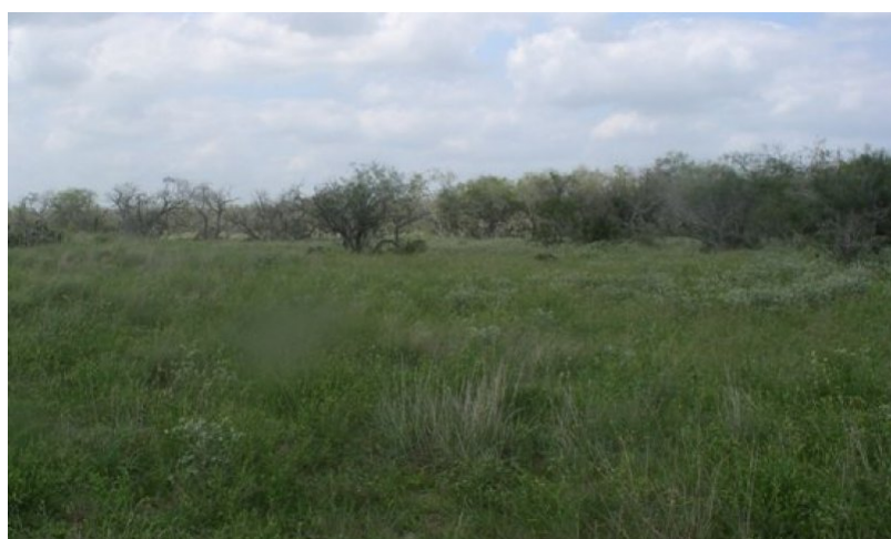
Figure 14. 2.1 Shrubland Community

The Shrubland Community results from a transition from the Grassland State (1) to a new state dominated by woody plants. A threshold has been crossed. This transition occurs through expansion and coalescence of live oak mottes and establishment of mesquite and other woody species. Running or “thicketized” live oak composes part of the live oak cover. Sandbur, fringed signalgrass, red lovegrass, thin paspalum, camphor daisy, partridgepea, and crotons are the major herbaceous species in the Shrubland Community. A considerable amount of bare ground is present. Brush management coupled with prescribed grazing is necessary to shift the oak or mesquite shrubland back to the Grassland State. Once the woody plants become established, grazing management alone will not reverse the trend toward the Woodland Community. Continued selective brush management will be needed to maintain the Shrubland Community in the desired density of woody plants.