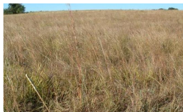
Tallgrass Prairie Community

With the application of Prescribed Grazing, Brush Management, and Prescribed Burning conservation practices, the tall/midgrass prairie community can be reverted back to the tallgrass prairie community.