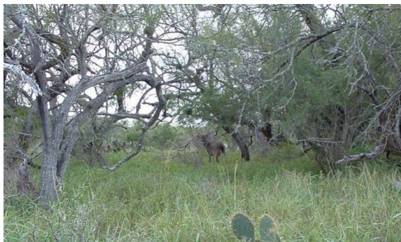
Figure 14. 3.1 Shrubland Community

This plant community is a Shrubland Community (3.1) having greater than 20% woody canopy dominated by mesquite and or juniper. Other species present in small amounts are cedar elm, hackberry, and live oak. The herbaceous understory is almost nonexistent. Shade tolerant species such as Texas wintergrass tends to dominate the site where mesquite is the major woody plant. When the canopy of Juniper increases toward a cedar breaks type community most grasses have disappeared. Continuous grazing by domestic livestock has accelerated the shift. The tallgrass prairie can be restored by prescribed burning and prescribed grazing but will require many years of burning due to light fuel load of fine fuel and the absence of a seed source for the tall grasses. Chemical control alone is usually a good option for treatment on a large scale especially where a seed source is present. Mechanical treatment of this site along with seeding is a good when seeding is needed. Due to the presence of shade, the amount of grass cover is greatly reduced which in turn reduces forage production from the historic state.