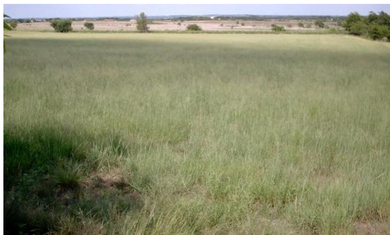
Figure 19. 4.2 Pastureland Community