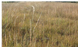
Tall and Midgrass Prairie Community