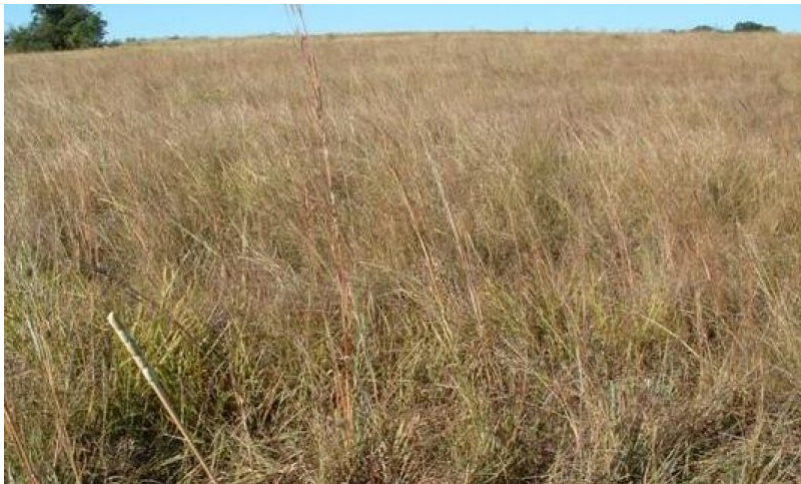
Figure 5. 1.1 Tallgrass Prairie Community

The interpretive plant community for this site is the reference plant community(1.1). The community is dominated by warm-season perennial tallgrasses such as little bluestem, big bluestem, eastern gamagrass and Indiangrass. Other major perennial grass species such as switchgrass, sideoats grama and silver bluestem are well dispersed through the site. Perennial forbs such as sunflowers ( Simsia spp.), prairie clovers ( Dalea spp.), bundleflowers ( Desmanthus spp.), and daleas ( Daleas spp.) are well represented throughout the community. This plant community evolved with a short duration of heavy use by large herbivores followed by long rest periods due to herd migration along with occasional fire. This state can go directly to the Shrubland Community (3.1), in the absence of fire or brush management to assist in suppressing the brush species, and still have the tallgrass component present in the community. With heavy grazing pressure and the subsequent removal of fire, the historic community will change into a Tall and Midgrass Prairie Community (1.2), a Short and Midgrass Prairie Community (2.1) or Shrubland Community (3.1). The changes within the grassland communities can change fairly rapid while the communities having an increase of woody plants are somewhat slower.