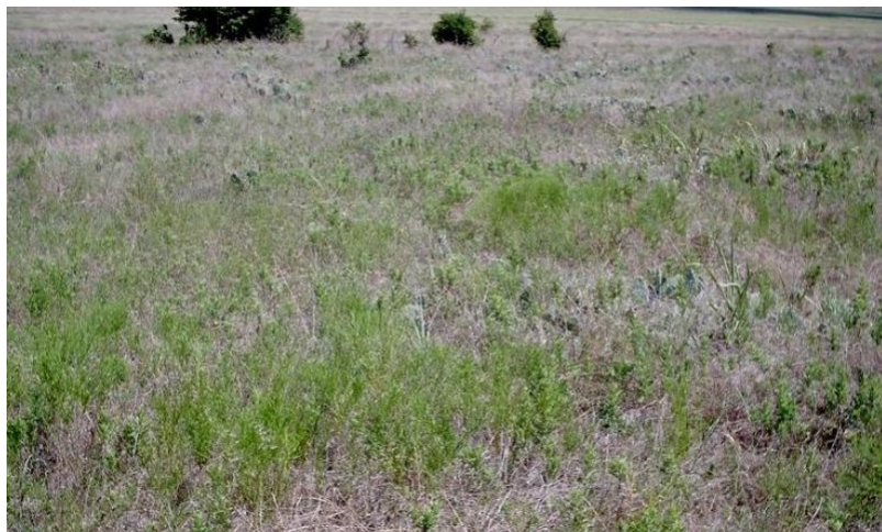
Figure 11. 2.1 Short & Midgrass Prairie Community

The Short and Midgrass Prairie Community (2.1) consists of short and mid grasses with 5 to 15 percent canopy of woody plants. As this community matures, brush canopy along with grasses such as Texas wintergrass, threeawns ( Aristida spp.) and annuals continues to increase. Warm-season perennial tallgrasses such as Indiangrass and switchgrass have all but disappeared. Continuous overgrazing by domestic livestock has accelerated the shift. The shift to this state has occurred due to the absence of fire or other means of brush suppression coupled with heavy grazing by domestic livestock. The grass species that dominate the site are mostly annual cool-season species. This state can be reverted back to near reference condition by some means of brush suppression and grazing management. Without this treatment the site will continue to shift toward more dense stands of brush. This change can be anywhere from as little as one year to ten or more depending on the grass species present and degree of grazing management.