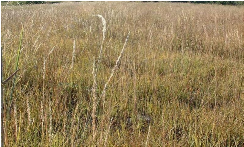
Figure 12. 1.2 Tall and Midgrass Prairie Community

This transitional community occurs with heavy yearlong grazing by large herbivores without the application of fire or brush management practices. The tallgrasses will start to disappear from the plant community. Brush not native to this site (mesquite, juniper, and pricklypear cactus, etc.) appear and become readily established. Cedar elm ( Ulmus crassifolia ), bumelia, and hackberry also start to increase in density and stature. Texas wintergrass ( Nassella leucotricha ) increases as brush canopy increases. It is more shade tolerant since most of growth occurs during the cool season when brush has lost its leaves. This plant community consists of less than 10 percent canopy of woody plants. Continuous heavy grazing by domestic livestock has accelerated the shift towards the Shrubland State (3.1). The tall and midgrass prairie community (1.2) can revert back to the Tallgrass Prairie Community (1.1) with conservation practices such as brush management, prescribed burning and/or prescribed grazing. Without prescribed burning and/or prescribed grazing, this plant community would continue to shift toward the Short and Midgrass Community (2.1) or Shrubland Community (3.1).