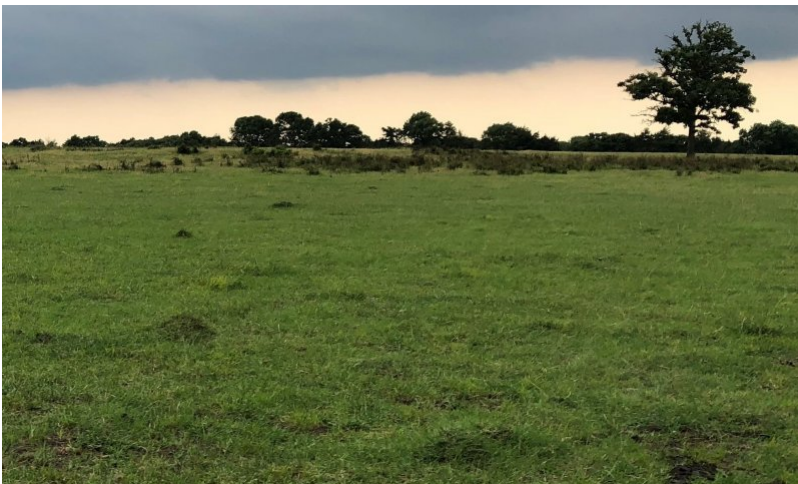
Figure 10. Ravia soils. Johnston County, OK

This state represents a change in land use from rangeland to pastureland. The soil structure and biology has been altered and the site is dominated by introduced species. Management of introduced forages requires more inputs than native grasses. Careful consideration should be taken prior to planting to ensure the result meets the desired use. Ratings for forage yields can be found under the non-irrigated crop yield section in web soil survey. As with any fertility management program, current soil tests should be taken before planting and subsequent fertilization of introduced pastures. The most common forage species on these sites include Bermudagrass and Old World Bluestems(eg. KR Bluestem). Without brush management, woody species such as mesquites, junipers, elms, or honey locust may invade these sites. There may be opportunities to plant native grass species on these sites to restore the reference plant communities. The success of this type of restoration is highly variable and depends on the remaining soil resources and past management. This type of endeavor often requires site specific planning and evaluation. However, the species described in the reference state are a good resource for initial planning of any restoration project.