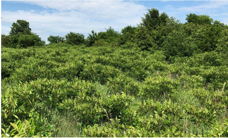
Figure 11. Durant soils. Murray County, OK

This state describes the invaded, woody dominated plant community of the Clay Upland site. The ecological processes are dominated by woody species including mesquite, honey locust, elm, and juniper species. Some herbaceous plants persist under the woody canopy or in interspaces. Usually, shade tolerant species like Texas wintergrass are prominent herbaceous components in this community. There may also be an increase in prickly pear in this state.