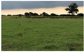
Converted Land Use