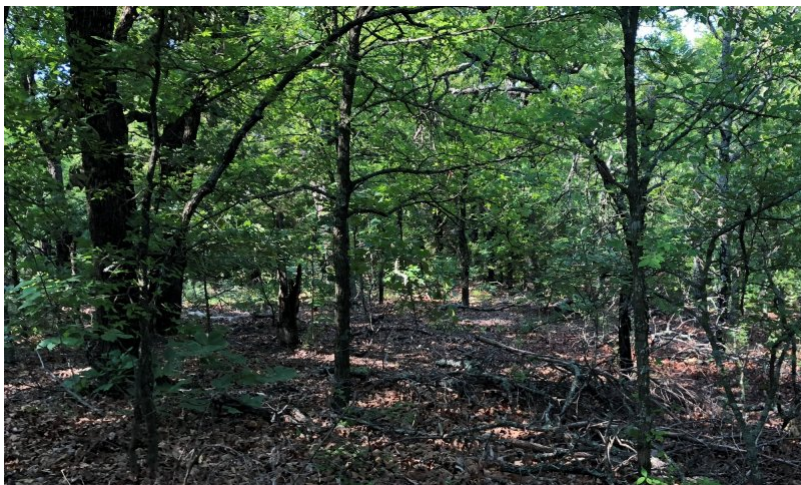
Figure 8. Travertine soils, Murray County, OK

This state is often the result of fire suppression for multiple years. Non fire-tolerant woody species such as elms, hackberry and juniper have increased and created a shaded environment with a heavy accumulation of leaf litter. Ecosystem processes are significantly altered and the herbaceous community is dominated by shade tolerant understory species. Greenbriar, grape and other shrubs and vines may create a dense understory layer.