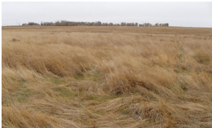
Figure 11. Typical Reference Community vegetation found on the Saline lowland site.

Interpretations are based primarily on the 1.1 Prairie Cordgrass-Alkali Cordgrass-Nuttall's Alkaligrass Plant Community Phase. This community evolved with grazing by large herbivores, occasional prairie fires, and periodic flooding events, and can be found on areas that are properly managed with grazing and/or prescribed burning. The potential vegetation is about 85 percent grasses and grass-like plants and 15 percent forbs. The major grasses include prairie and alkali cordgrass, and Nuttall's alkaligrass. Other grass and grass-like species present include western wheatgrass, slender wheatgrass, inland saltgrass, switchgrass ( Panicum virgatum ), sedge ( Carex ), and foxtail barley. Salt tolerant forbs such as alkali plantain ( Plantago eripoda ), western dock ( Rumex aquaticus ), and Pursh seepweed ( Suaeda calceoliformis ) are common. Interpretations are based primarily on this plant community phase. This community phase is diverse, stable, productive, and well adapted to both saline soils and the Northern Great Plains climatic conditions. Community dynamics, the nutrient and water cycles, and energy flow are functioning properly. Litter is properly distributed with very little movement offsite and natural plant mortality is very low. This community is resistant to many disturbances except continuous grazing, tillage, or development into urban or other uses. The diversity in plant species allows for both the fluctuation of flooding and large variations in climate.