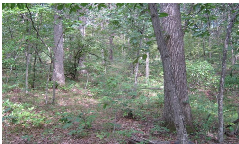
Figure 11. Dark Hollow Conservation Area, Sullivan County, Missouri

This phase has an overstory that is dominated by white oak and black oak with hickory and northern red oak and post oak also present. This woodland community has a two-tiered structure with an open understory and a dense, diverse herbaceous ground flora. Periodic disturbances including fire, ice and wind create canopy gaps, allowing white oak and black oak to successfully reproduce and remain in the canopy.