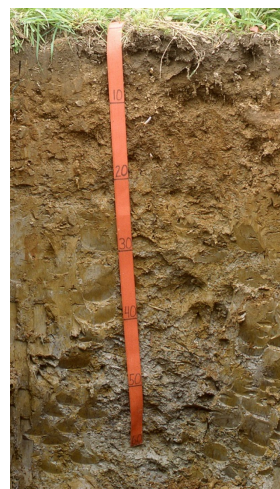
Figure 9. Keswick series

The accompanying picture of the Keswick series shows a thin, light-colored surface horizon overlying the brown clayey till. Indicators of seasonal wetness (redoximorphic features) are visible in the picture below about 20 inches, but wetness does not impact the woodland reference community for this ecological site. scale is in inches.