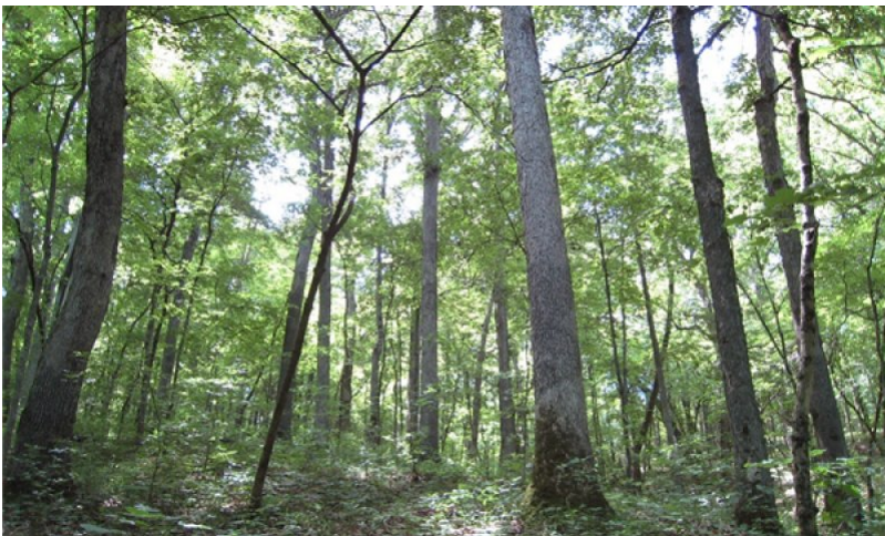
Figure 11. MDC Hart Creek Conservation Area, Boone County, MO

This community is the most productive upland forest in the MLRA. This forest community has a multi-tiered structure, and a canopy that is 75 to 100 feet tall with 80 to 100 percent closure. The sub-canopy and understory are well developed. An abundance of shade tolerant forest generalists, such as May apple, Christmas fern, tick trefoil and white snakeroot, cover the ground. In the absence of disturbance, more shade tolerant species increase such as sugar maple, basswood, white ash and others increase in importance and add structural diversity to the system. In addition, more shade-loving forest shrub (e.g., spicebush) and herbaceous (e.g., bloodroot) species also increase.