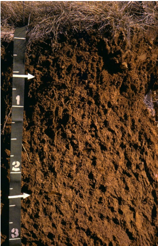
Figure 9. Menfro series soil profile

The accompanying picture of the Menfro series shows a thin, light-colored surface horizon to about 7 inches overlying the brown silt loam to silty clay loam subsoil. The excellent rooting characteristics of Menfro and other soils allow for productive, diverse reference vegetation communities on this ecological site. Scale is in feet.