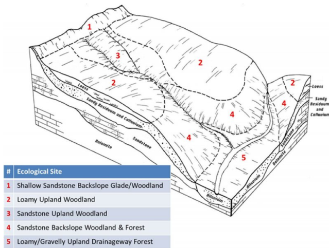
Figure 2. Landscape relationships for this ecological site.