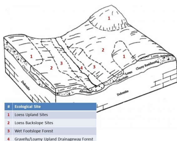
Figure 2. Landscape relationships

The following figure portrays a probable landscape position of this ecological site, and landscape relationships among the major ecological sites in the uplands. The site is within the area labeled “3”, on footslopes. Loess Upland Woodland and Forest sites, on upland hillslope shoulders and upper backslopes are included in the area. Gravelly/Loamy Upland Drainageway Forest sites are occasionally downslope.