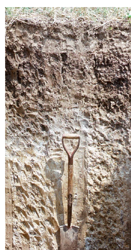
Figure 9. Glensted series

The accompanying picture of the Glensted series shows a dark silt loam surface horizon over the claypan, a clay horizon that impedes water movement and root penetration. Indicators of seasonal wetness (redoximorphic features) are visible in the lower part of the profile.