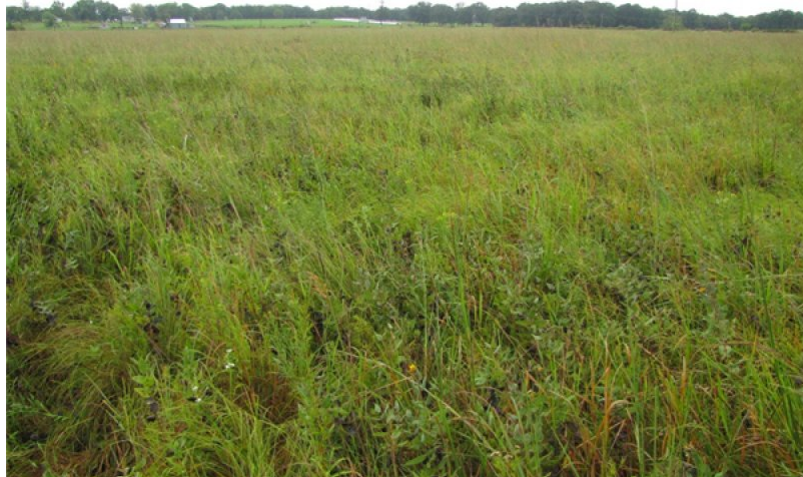
Figure 11. Reference state at Hite Prairie Conservation Area, Morgan County, Missouri; photo credit MDC.

Two phases can occur that will transition back and forth depending on fire frequencies.