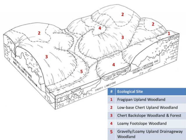
Figure 2. Landscape relationships for this ecological site.

The following figure (adapted from Hughes, 1982) shows the typical landscape position of this ecological site, and landscape relationships with other ecological sites. Chert Exposed Backslope Woodland sites are within the area labeled “3”, on lower backslopes with southerly to westerly exposures. Chert Protected Backslope Forest sites are on the corresponding northerly to easterly exposures. Upper slopes and shoulders within the area are in the Chert Upland Woodland ecological site. Low-base Chert upland Woodland sites, labeled “2”, are often upslope on crests and shoulders.