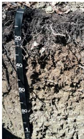
Figure 9. Alsup series

The accompanying picture of the Alsup series shows a thin gravelly silt loam surface horizon over a yellowish brown, clayey subsoil. The olive yellow colors below about 80 cm in this picture are inherited from the shale parent material. Soft shale is below one meter, at the bottom of this picture. Scale is in centimeters.