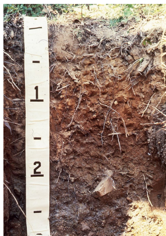
Figure 9. Knobtop series

silty clay loam subsoil. Igneous rock fragments are shown in this profile below about 2 feet. Hard igneous bedrock is at the bottom of the picture, just above 3 feet. Scale is in feet.