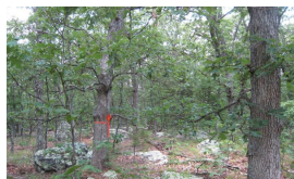
Post Oak-Northern Red Oak/Eastern Redcedar-Oak and Hickory Saplings/Poverty Oat Grass