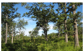
Post Oak-Northern Red Oak/Aromatic Sumac/Poverty Oat Grass-Little Bluestem