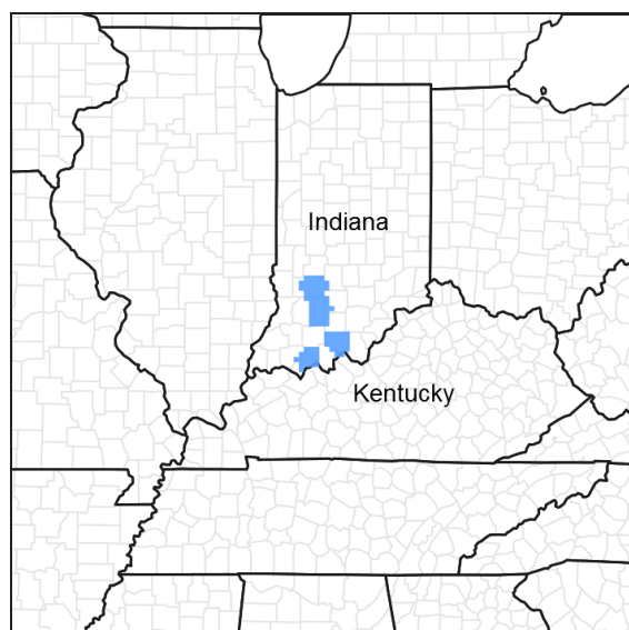
Figure 1. Mapped extent

Provisional. A provisional ecological site description has undergone quality control and quality assurance review. It contains a working state and transition model and enough information to identify the ecological site.