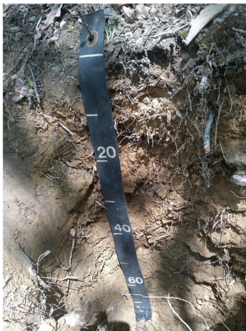
Figure 6. Berks scale centimeters

The soils of this site are dark grayish brown, shallow to moderately deep silt loams and loams and are represented by the Inceptisol soil order. Sandstone and shale fragments and rocks occur in the profile in quantities high enough to classify as skeletal. Rock fragments and bedrock outcrop occur on the soil surface, but not to the extent that they impair the production of native vegetation. Plant-soil moisture relationships are adequate for adapted plants. In healthy condition, rills, gullies, wind scoured areas, pedestals, and soil compaction layers are not present on the site.