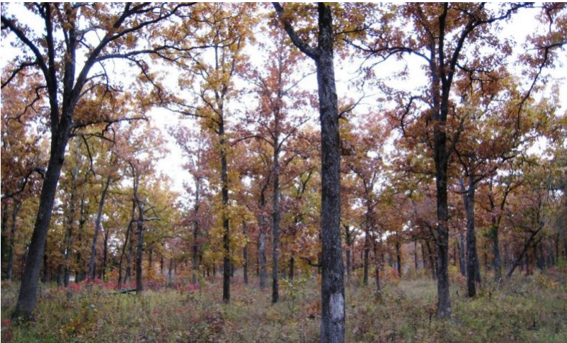
Figure 11. St. Francois State Park, MDNR, St. Francois Co.