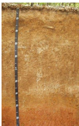
Figure 9. Loring series

The accompanying picture of the Loring series shows a thin surface horizon and a light-colored albic horizon over a brown silt loam subsoil at about 20 cm. A fragipan is below about 55 cm in this picture. The fragipan is a barrier to roots. scale is in centimeters.