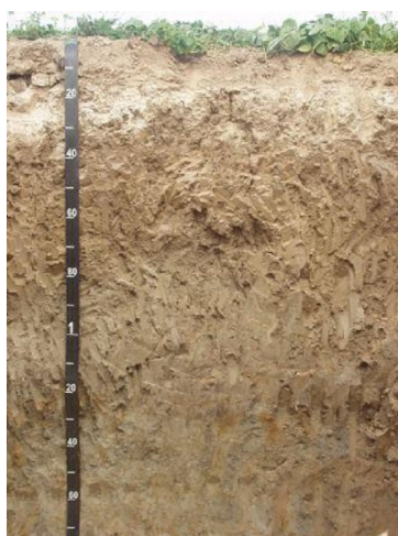
Figure 9. Overcup series

The accompanying picture of the Overcup series shows a thin silt loam surface horizon over a light-colored leached layer called an albic horizon at about 20 cm. Below this is the claypan, a clay horizon that impedes water movement and root penetration. Indicators of seasonal wetness (redoximorphic features) are visible in the lower part of the profile. scale is in centimeters.