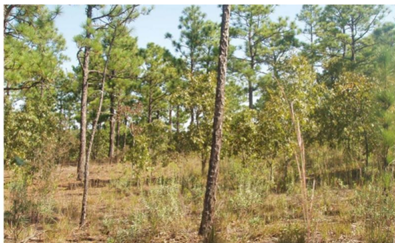
Figure 11. Longleaf pine with accelerating oak encroachment.

This community phase is generally the result of lower fire frequency. Either fire suppression or a change in fire regime (burning every 3 to 5 years, dormant season burns) allows woody vegetation growth in the mid- and understory. Species composition is similar to phase 1.1. The dominant overstory species is longleaf pine, which are widely spaced across the landscape. Because of the buildup of litter and resulting lack of bare mineral soil, longleaf pine regeneration is inhibited. If fire suppression continues, oaks and other hardwoods will thrive, eventually out-competing any young longleaf that have managed to become established. In addition, herbaceous groundcover is not as abundant as in phase 1.1, although species composition is similar. Changes in fire regime result in successful hardwood encroachment, litter accumulation, and a subsequent shift in herbaceous species abundances.