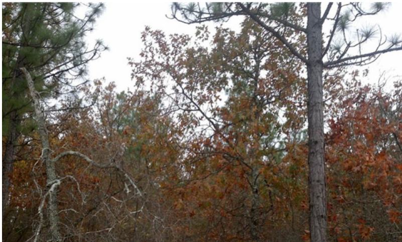
Figure 13. State 3, cropped image