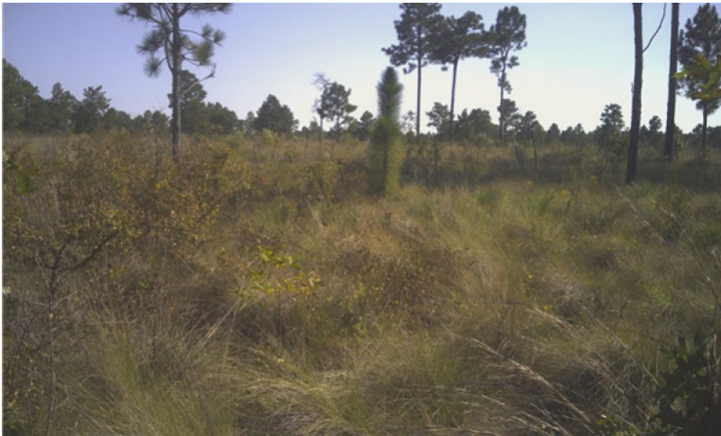
Figure 10. Community Phase 1.1

The overstory of this community is dominated by widely-spaced mature longleaf pine. Typical pine canopy cover ranges from 5 to 40 percent. Canopies are open and trees are uneven-aged but the community also includes variably-sized openings with even-aged trees. These openings result from windstorms, timber harvest, hot fires, or insect-induced mortality. For longleaf pine seed germination to occur, abundant light and bare soil are needed. These conditions are found in canopy gaps immediately following fire events. Common mid-story vegetation cover is generally sparse and composed mainly of oak species. Turkey oak ( Quercus laevis ) is the most common, followed by bluejack ( Q. incana ) and dwarf post oak ( Q. margarettae ). Some oaks can persist even though frequent fire discourages hardwood establishment. For most sites, a fire return interval of two to three years prevents hardwood invasion (Edwards et al., 2013). Species richness is high in the herbaceous understory of these communities (Peet and Allard, 1993). Wiregrass ( Aristida species) is the dominant grass, but bluestems ( Schizachrium and Andropogon species), and rosette grass ( Dicanthelium sp.) can also be found. Georgia bear grass ( Nolina georgiana ), a rare species, is also found in dry longleaf pinelands (Sorrie, 2011). Grass-dominated groundcover provides necessary fine fuels for the spread of surface fires. Frequent low intensity fire is necessary for the perpetuation of this community phase.