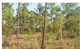
Mature longleaf pine overstory, mid- and understory oak encroachment, in need of fire

A fire frequency of two to three years controls encroaching hardwood trees and shrubs. Longleaf pine seed germination is promoted by eliminating thick litter layer development. Extended fire suppression or fire regime alteration will cause community phase 1.1 to transition to community phase 1.2. If the fire return interval persistently exceeds three years or fires occur during the dormant season, encroaching hardwoods will become well established. Longleaf pine seed germination will be severely inhibited due to litter accumulation and lack of bare soil.