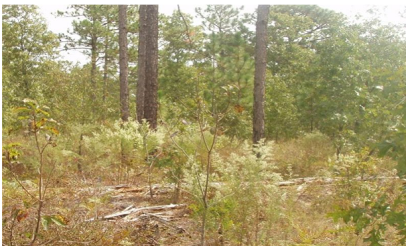
Figure 12. State 2

More than five years of fire suppression crosses a threshold from state 1 to state 2. This state is characterized by scattered longleaf pine. Continued fire suppression allows turkey oak seedlings to reach basal diameters greater than four inches, which allows the hardwoods to resist surface fires that may occur. Thus, turkey oak cover begins to rival that of longleaf pine, and, due to lack of longleaf pine regeneration will become dominant. Loblolly pine ( Pinus taeda ) may also begin to encroach. Herbaceous species richness suffers from continued fire suppression. Increased shade negatively impacts native groundcover as hardwood coverage continues to expand. The result is