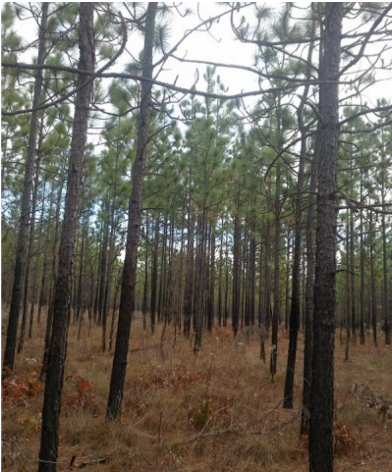
Figure 16. State 5: Young longleaf plantation