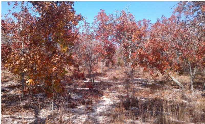
Figure 15. Turkey oak-dominated site at Fort Gordon in GA

This could probably use some fleshing out... This community phase is naturally present in patches within the larger ecological site, most often on microsites that are protected from fire (Frost and Langley, 2008; Edwards et al., 2013). However, long-term fire suppression or lack of forest management can lead to larger spatial coverage of this state (Sorrie, 2011). After continued encroachment of fire-tolerant oaks, longleaf pine reproduction eventually ceases. This leaves the site open for continued scrub oak domination. Fine fuels needed to carry low intensity ground fires are absent, but coarser fuels such as branches and leaves are present.