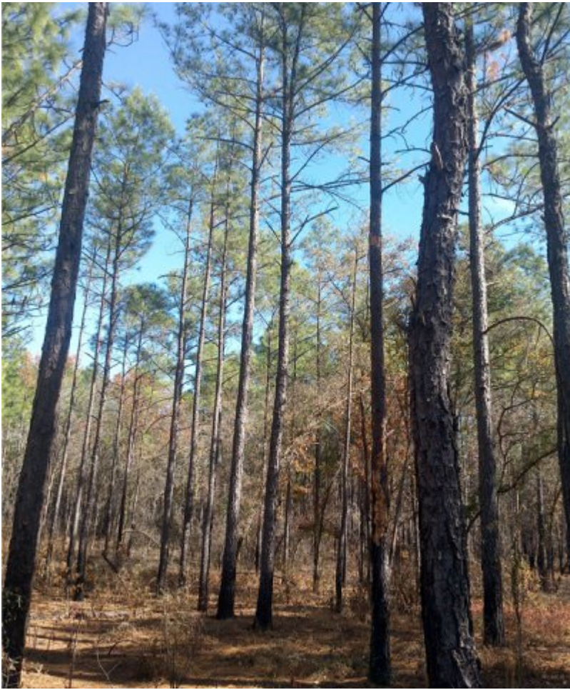
Figure 17. State 6 - Loblolly pine plantation