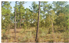
Mature longleaf pine overstory, mid- and understory oak encroachment, in need of fire