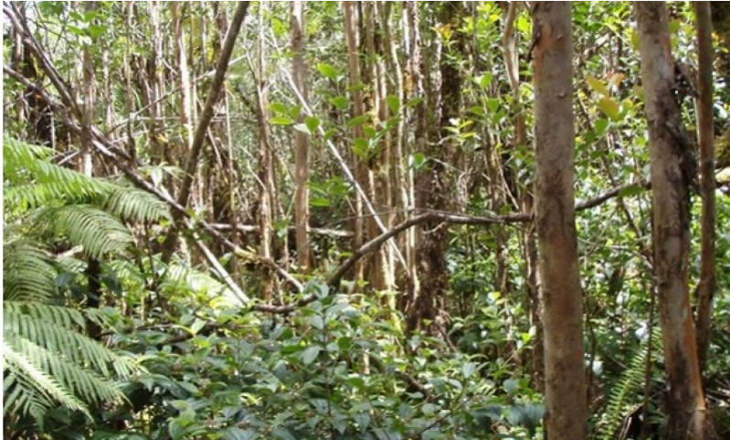
Figure 13. Weed invaded forest 7/1/08 D Clausnitzer MU905