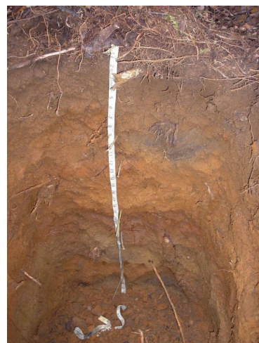
Figure 6. Akaka soil.

The soil moisture regime is perudic, which is defined as a soil moisture regime in climates where precipitation exceeds evapotranspiration in all months of normal years, the moisture tension rarely reaches 100 kPa in the soil moisture control section, although there are occasional brief periods when stored moisture is used, and water moves through the soil in all months when it is not frozen (this soil is never frozen).