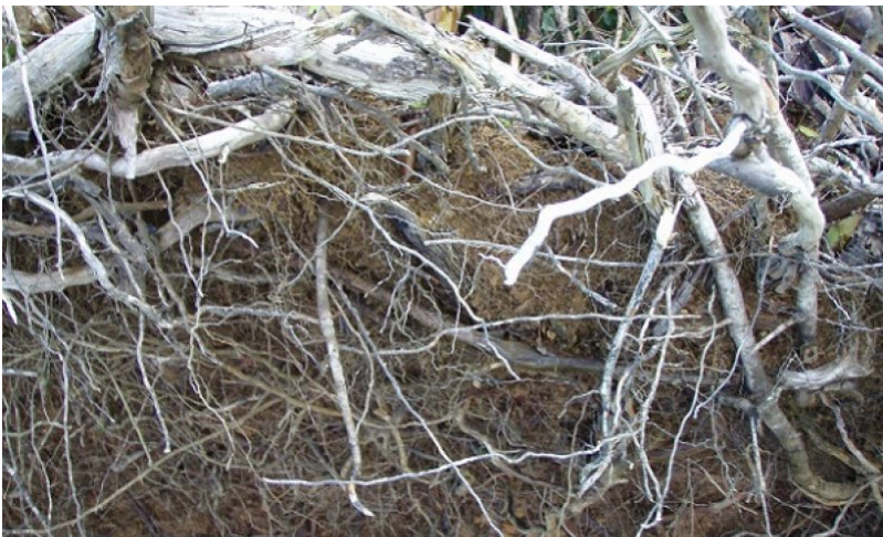
Figure 18. Closeup of strawberry guava roots D Clausnitzer generic photo

This community phase is dominated by introduced species in both the overstory and understory. Strawberry guava is typically the dominant tree species because it invades sites by seeds spread by pigs and reproduces vegetatively by root suckers. Strawberry guava can dominate a site apparently indefinitely because of the dense shade it produces and the competitive advantage conferred by its very dense root system. Strawberry guava can grow and persist under shady canopies. There is almost no understory under dense stands of strawberry guava. Native uluhe fern cover gradually declines as shade increases. Emergent `ohi`a lehua and koa trees may persist in this community for a time along with remnant hapu`u and uluhe ferns. Soil damage by feral pigs creates bare soil areas that are susceptible to erosion by the heavy rains in this ecological site; this apparently leads to the pedestaling of tree roots that is commonly observed