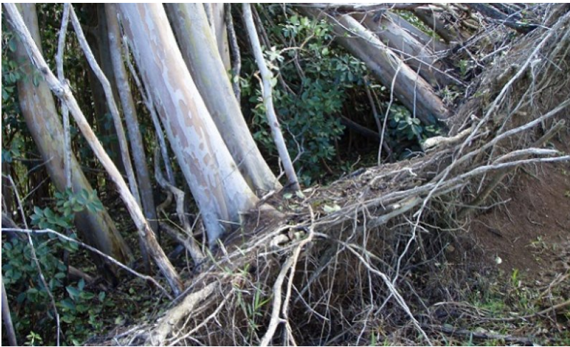
Figure 17. Strawberry guava stand root system D Clausnitzer generic photo