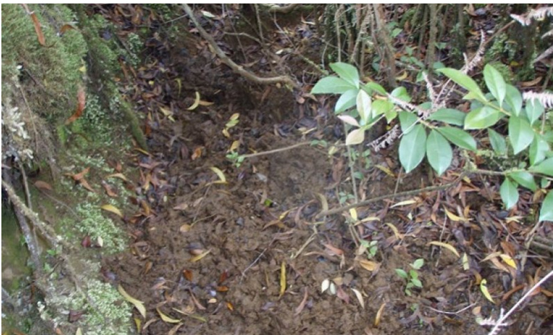
Figure 14. Pig damage to soil surface 7/1/08 D Clausnitzer MU905