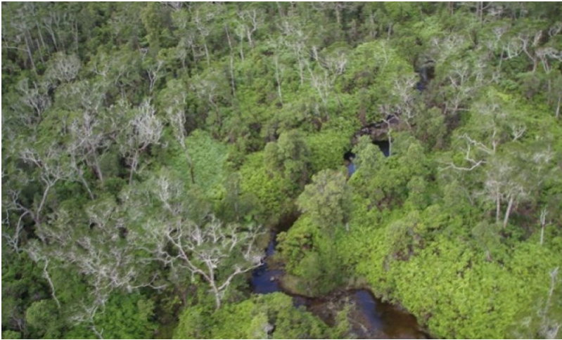
Figure 12. Aerial view with stream 9/15/08 D Clausnitzer

The general appearance is a forest with an open overstory 20 to 30 feet (6 to 9 meters) tall (sometimes taller) and 4 to 10 inches (10 to 25 centimeters) diameter at breast height. Dead snags up to about 60 feet (18 meters) tall and 30 inch (75 centimeters) diameter at breast height are common in many areas. Ohia lehua and koa trees reproduce successfully and occur at a variety of sizes. Scattered trees of other species, typically 10 to 20 feet (3 to 6 meters) tall, as well as shrubs and tree ferns, occur in varying densities. Uluhe fern covers a large percent of the area of this ecological site, both on the ground and climbing upon trees. Uluhe particularly dominates sloping stream banks. These forests have standing live timber of 100 to 500 cubic feet per acre, with a representative value of about 200 cubic feet per acre. Accurate measurement of standing live timber is difficult due to thick layers of moss on tree trunks and difficult accessibility to trees in uluhe thickets.