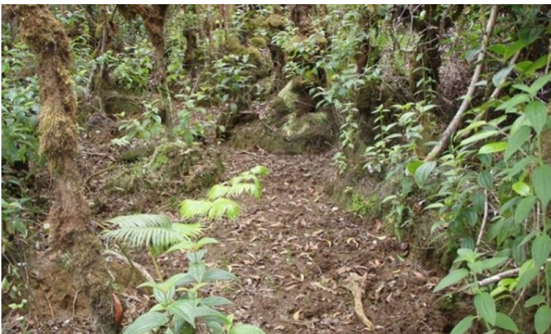
Figure 15. Pedestaling caused by soil erosion 7/1/08 D Clausnitzer MU905