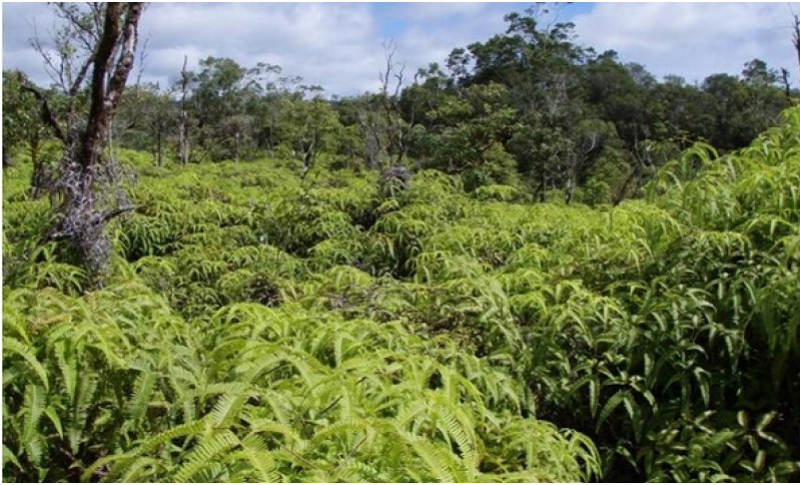
Figure 9. Open canopy area with dense uluhe Pepeekeo mauka 7/1/08 D Clausnitzer MU905