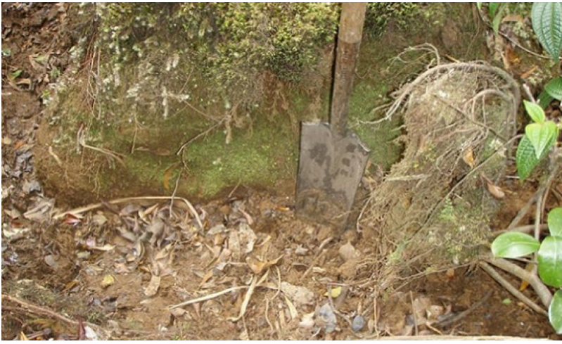
Figure 16. Closeup of erosion-caused pedestal 7/1/08 D Clausnitzer MU 905