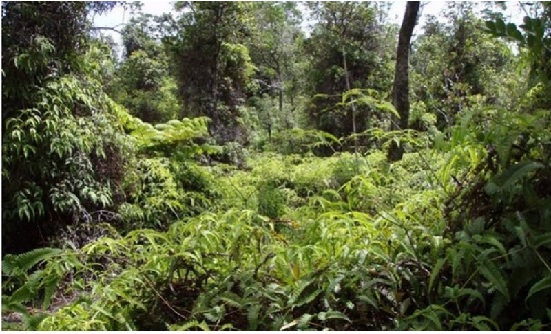
Figure 8. Reference community phase Pepeekeo mauka 7/1/08 D Clausnitzer MU905