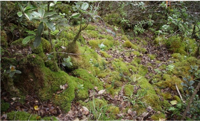
Figure 10. Soil surface cover 8/13/08 D Clausnitzer MU904