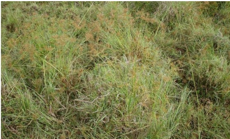
Figure 19. Grassland community phase 7/01/08 D Clausnitzer MU900

Because these grassland occur on patches of wetter soils occurring within areas that are actively grazed by domestic cattle, deep trampling of these sites often occurs. This maintains the sites in a muddy, disturbed condition that makes maintenance of desirable forages difficult.