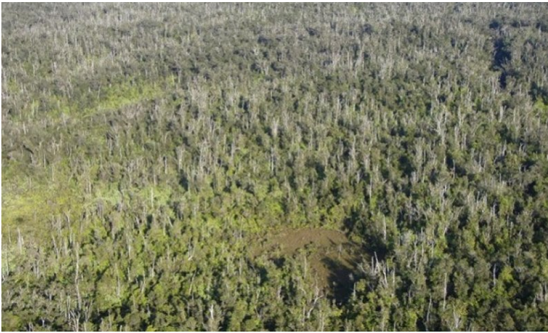
Figure 11. Aerial view 9/15/08 D Clausnitzer