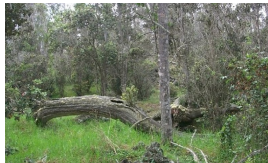
Koa - mamani/cape ivy/kikuyugrass - weeping grass

This community phase changes to phase 2.3 by removal of ungulates and absence of fire. These conditions allow shrubs and small trees to gain dominance.