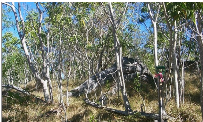
Figure 14. Young koa restoration site. 2/5/07 D Clausnitzer generic photo