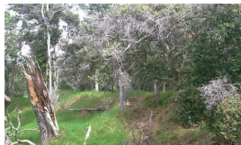
Koa - mamani/kikuyugrass/common vetch

This community phase changes to phase 2.1 by a combination of herbicidal weed control, prescribed grazing, brush management, and replanting of desirable forage species. The grazing prescription will require removal of livestock from the pasture until seeded or sprigged forage species have reestablished adequately to support grazing. Intensive weed control will be necessary. Thereafter, the grazing plan may require splitting the herd, creating additional water sources, and creating multiple pastures by cross-fencing.