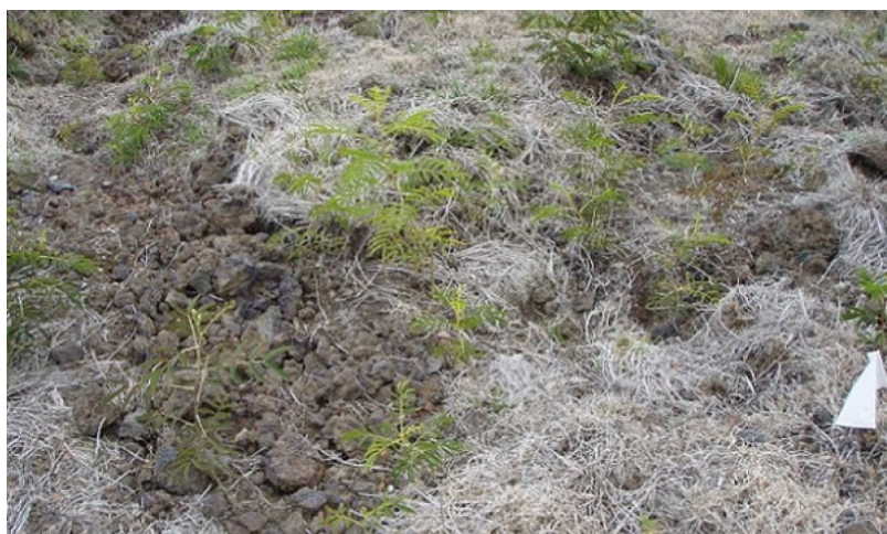
Figure 15. Koa seedlings on scarified and herbicided site.

This community phase consists of a dense stand of small to medium stature koa trees that have resprouted or been planted in grassland. There may or may not be large native trees present, depending on whether the grassland was in State 2 or State 3 previously. As the tree canopy closes, kikuyugrass will be outcompeted and replaced by meadow ricegrass, which persists unless killed by herbicide or deeper shade conditions and heavy tree litter. Other native plant species will begin to grow in the understory if a seed source is nearby.