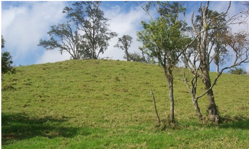
Figure 11. Kikuyugrass with sparse trees. 4/20/07 D Clausnitzer MU341

The dominant grass species in this pasture type is kikuyugrass, although pangolagrass ( Digitaria eriantha ) also has been planted on some sites. Pastures may include introduced leguminous forbs as well as a small admixture of cool season grass species.