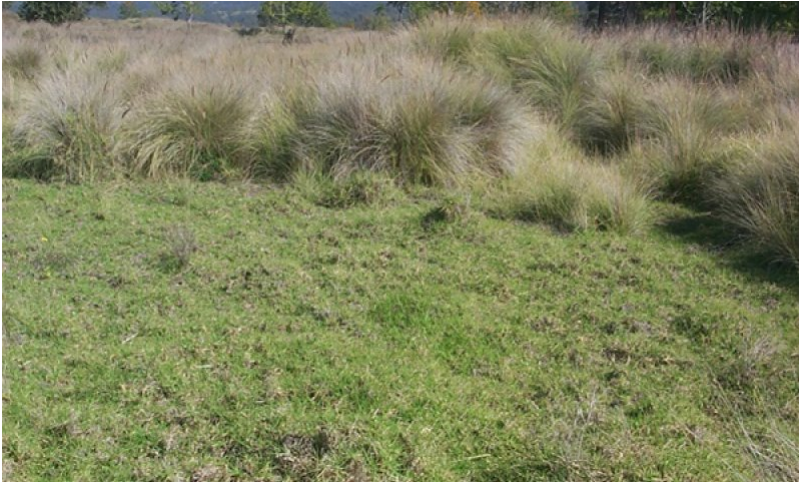
Figure 13. Kikuyugrass and fountaingrass. 4/20/07 D Clausnitzer MU341

This community phase has significant cover of grasses of relatively low forage value. Desirable forage legumes have been grazed out.