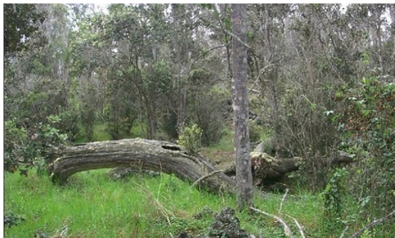
Figure 10. Mostly weeping grass due to shade. 8/4/05 D Clausnitzer MU135

Community phase 2.3 consists of dense cover of native and/or introduced shrubs, invasive vines, remnant grasses, and seedlings and saplings of native and/or introduced trees under a canopy of large native trees. In locations where weedy, introduced plants are low in abundance, the native shrubs pukiawe ( Styphelia tameiameia ) and aalii ( Dodonaea viscosa ) are common.