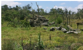
Koa - mamani/kikuyugrass - weeping grass