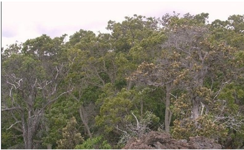
Figure 6. Reference community canopy. D Clausnitzer generic photo