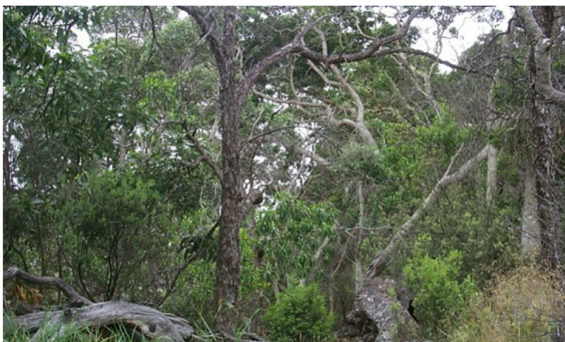
Figure 5. Reference community. D Clausnitzer generic photo