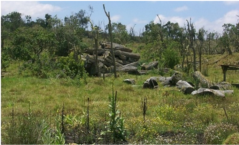
Figure 9. Site near old koa sawmill. 8/26/05 D Clausnitzer generic photo

This community phase has significant cover of grasses of relatively low forage value. Desirable forage legumes have been grazed out. Large ohia, koa, and mamani trees are present.