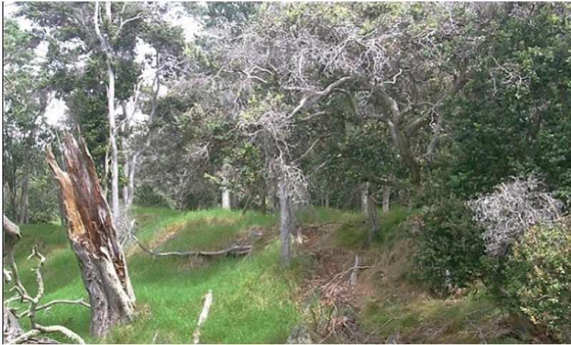
Figure 7. Kikuyugrass under native tree canopy. 8/4/05 D Clausnitzer MU135

The dominant grass species in this pasture type is kikuyugrass, although pangolagrass ( Digitaria eriantha ) also has been planted on some sites. Pastures may include introduced leguminous forbs as well as a small admixture of cool season grass species. Large native trees are common.