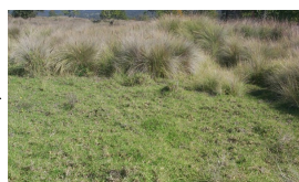
Kikuyugrass - sweet vernalgrass

This community phase changes to phase 3.2 by continuous grazing that weakens preferred forage grasses and legumes in relation to poorer forage species and weedy forbs.