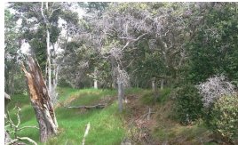
Koa - mamani/kikuyugrass/common vetch

This community phase changes to phase 2.1 by prescribed grazing. A prescribed grazing plan provides for intensive but temporary grazing of pastures that ensures that cattle consume some low-value forage species along with preferred forages and allows preferred forages time to recover from defoliation. Kikuyugrass is very competitive and adapted to grazing and is able to recover with proper management. The grazing plan may require splitting the herd, creating additional water sources, and creating multiple pastures by cross-fencing.