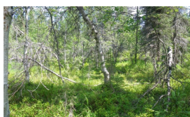
White spruce-paper birch/strawberryleaf raspberry- spirea/woodfern/bluejoint grass forest

Natural succession: Normal time and growth without disruptive ponding. As ponding subsides over time, facultative or obligate species become less competitive. This allows existing species that are less water tolerant to increase in abundance, commonly including an increase in the rates of colonization and growth of trees. The addition of a canopy increases the number of niches, particularly among shade-tolerant species; therefore, the abundance and richness of shrubs and forbs typically increase and those of bluejoint grass decrease. The period needed for this transition currently is unknown. It likely begins after active ponding ceases and is partially determined by the rate of propagule spread and growth rate of trees and shrubs.