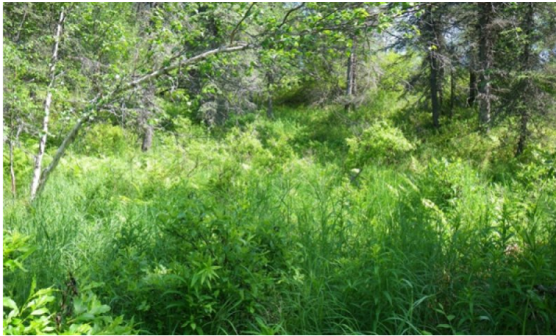
Figure 11. Typical area of community 1.2.