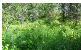
Barclay's willow/bluejoint grass/fireweed open scrubland