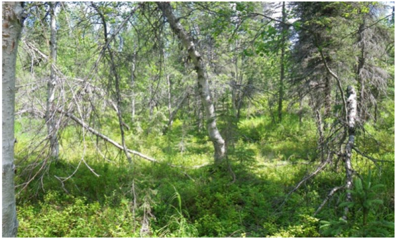
Figure 9. Typical area of community 1.1.