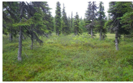
White spruce-paper birch/black crowberry-dwarf birch-lingonberry-spirea/moss woodland

Decreased hydrologic pressure - Changes in hydrologic inputs, such as a decrease in precipitation due to climate change, may cause a shift in community. Likewise, improved drainage in this community is likely to increase the chances of a woodland developing. Populations of hydrophilic graminoids may decrease. This provides space for existing populations of shrubs to expand and facilitates colonization of new species of shrubs and trees. The period needed for this transition currently is unknown; however, nearly 100 years is needed for white spruce trees in the early community phase to reach the age of those in the reference community phase.