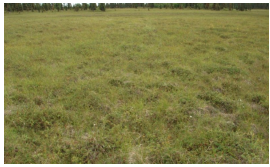
Marsh Labrador tea-black crowberry-bog blueberry-dwarf birch/sedge-cottongrasses scrubland