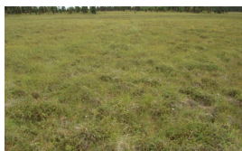
Marsh Labrador tea-black crowberry-bog blueberry-dwarf birch/sedge-cottongrasses scrubland

Decreased hydrologic pressure - Changes in hydrologic inputs, such as a decrease in precipitation due to climate change, may cause a shift in community. Likewise, improved drainage in this community is likely to increase the chances of less hydrophytic shrubs colonizing. Over time, plant species that are less hydrophilic, are more competitive, and have a slower rate of reproduction may colonize the early ponding community phase. Populations of extant shrubs and graminoids may increase. The period needed for this transition currently is unknown. It likely depends on various factors, such as the rate of drying of the soil and distance to a seed source of colonizing plants.