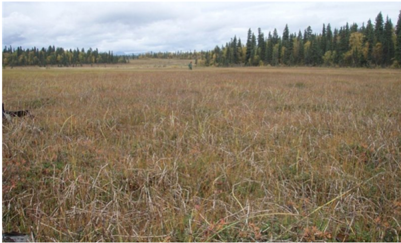
Figure 13. Typical area of community 1.3.