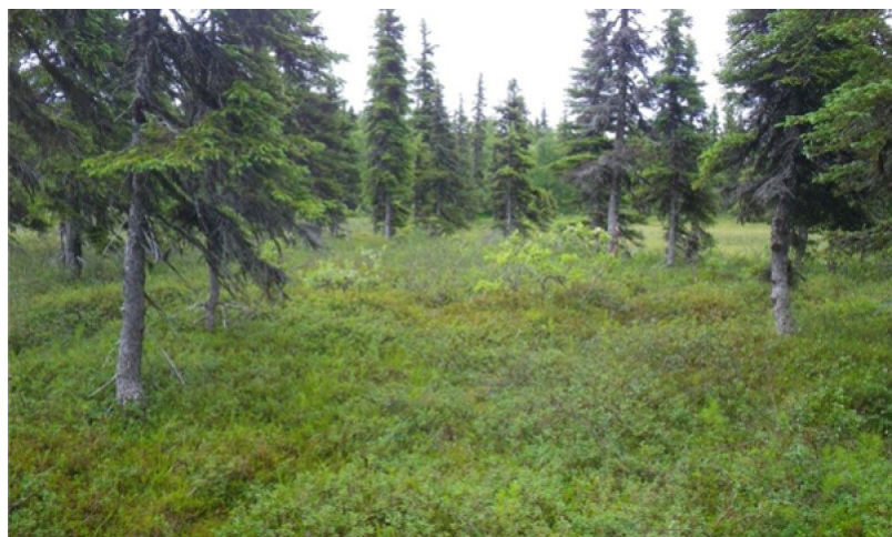
Figure 9. Typical area of community 1.1.

Community Phase Canopy Cover (Vegetation data in the table are provided as constancy (percent) and average canopy cover (percent) of the most dominant and ecologically relevant species for this community phase.)