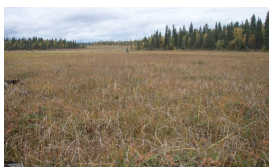
Water sedge-variegated sedge/black crowberry-marsh Labrador tea-dwarf birch/moss scrubland