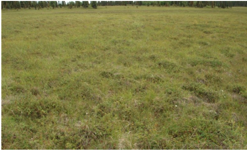
Figure 11. Typical area of community 1.2.